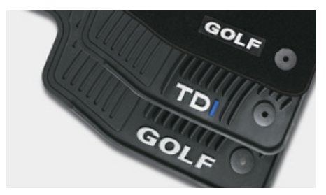
MojoMats<sup>®</sup> and Monster Mat<sup>®</sup>