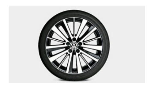
18" Preston Wheels