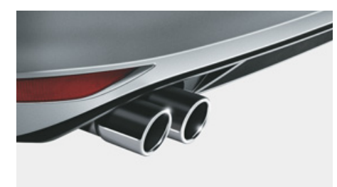
Chrome Exhaust Tips