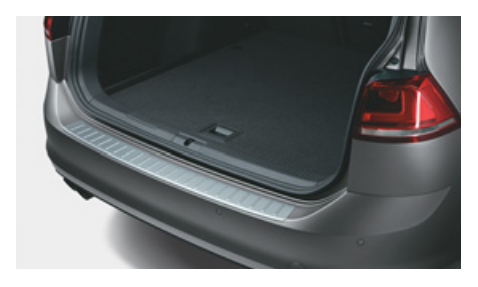
Rear Bumper Protection Plate