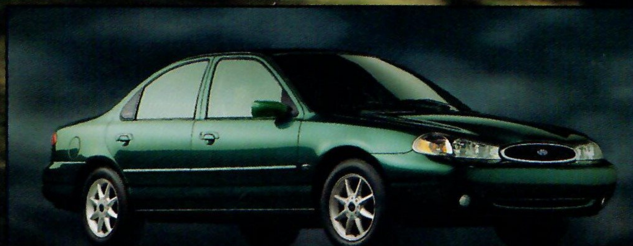
Contour SE with the optional Comfort Group in Pacific Green Clearcoat Metallic.

Your head says 4-door sedan, but your heart has itself set on fun to drive, sporty. What was once a bewildering dilemma is now a simple matter of choosing Ford Contour. Contour brings a satisfying blend of power, agility and control to the world of four doors. A very satisfying blend. How can you be sure? Drive it. With Contour, one test drive is all we ask. And all you'll need.