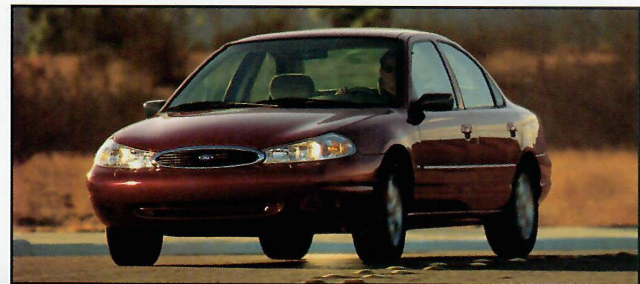
Contour LX in Cabernet Red Clearcoat Metallic.