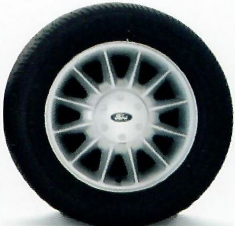
15" 12-spoke aluminum wheels (included in SE Sport Group)