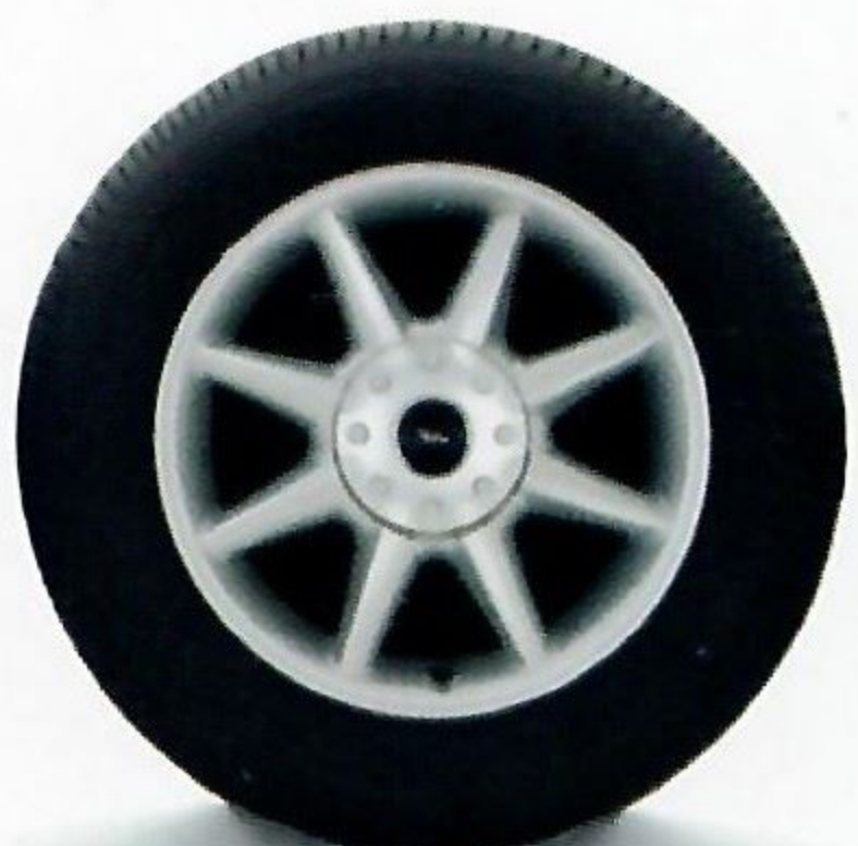
15" 8-spoke aluminum wheels (optional with SE and included in SE Comfort Group)