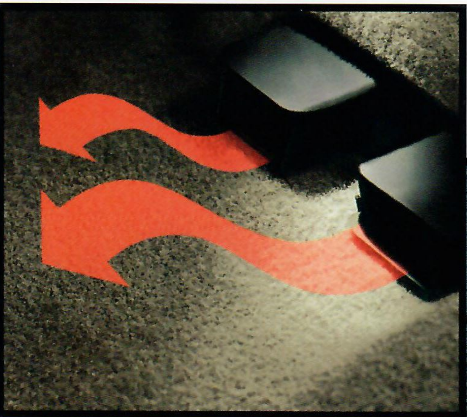
Standard heating is distributed through vents on the instrument panel, floor, and through auxiliary heat ducts in back for the benefit of rear passengers.