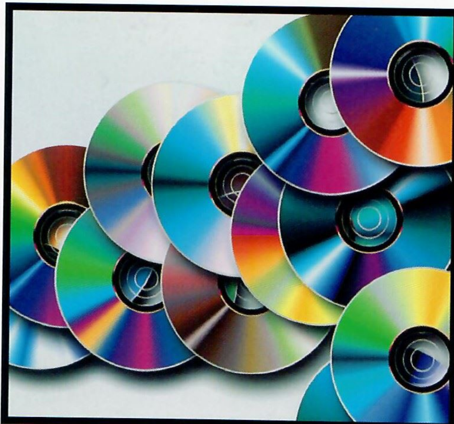
The optional AM/FM stereo/single CD radio includes Premium Sound for added listening enjoyment.