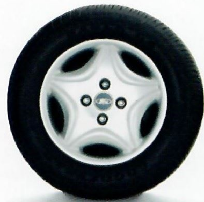
Standard 14" wheel covers with bolt-on appearance