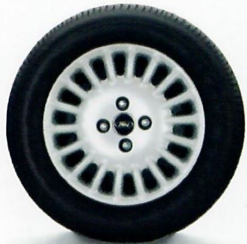
15" wheel covers with bolt-on appearance (optional with SE)