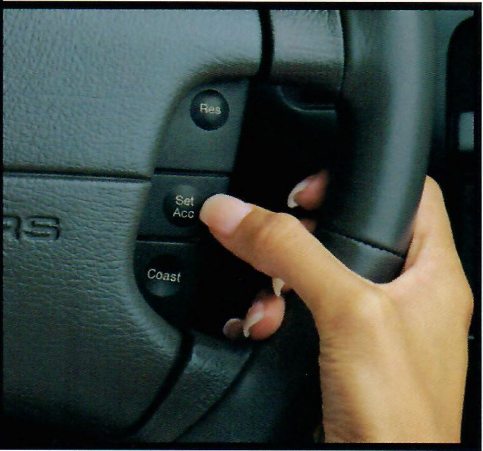
Speed control is standard on Contour SE. You can operate it without taking your hands from the wheel.