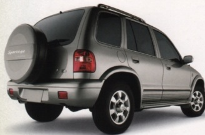
Sportage Limited shown

The Sportage has done it all — won its class in the Baja 1000, flown across the finish line of the Paris-Dakar Rally and been class champion of the Laughlin SCORE Desert Series.