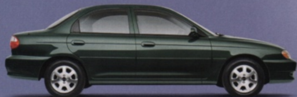
Sephia LS shown