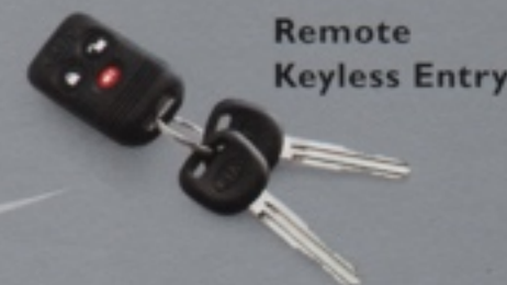
Remote Keyless Entry

The ability to accessorize our cars is what separates us from the water buffalo.