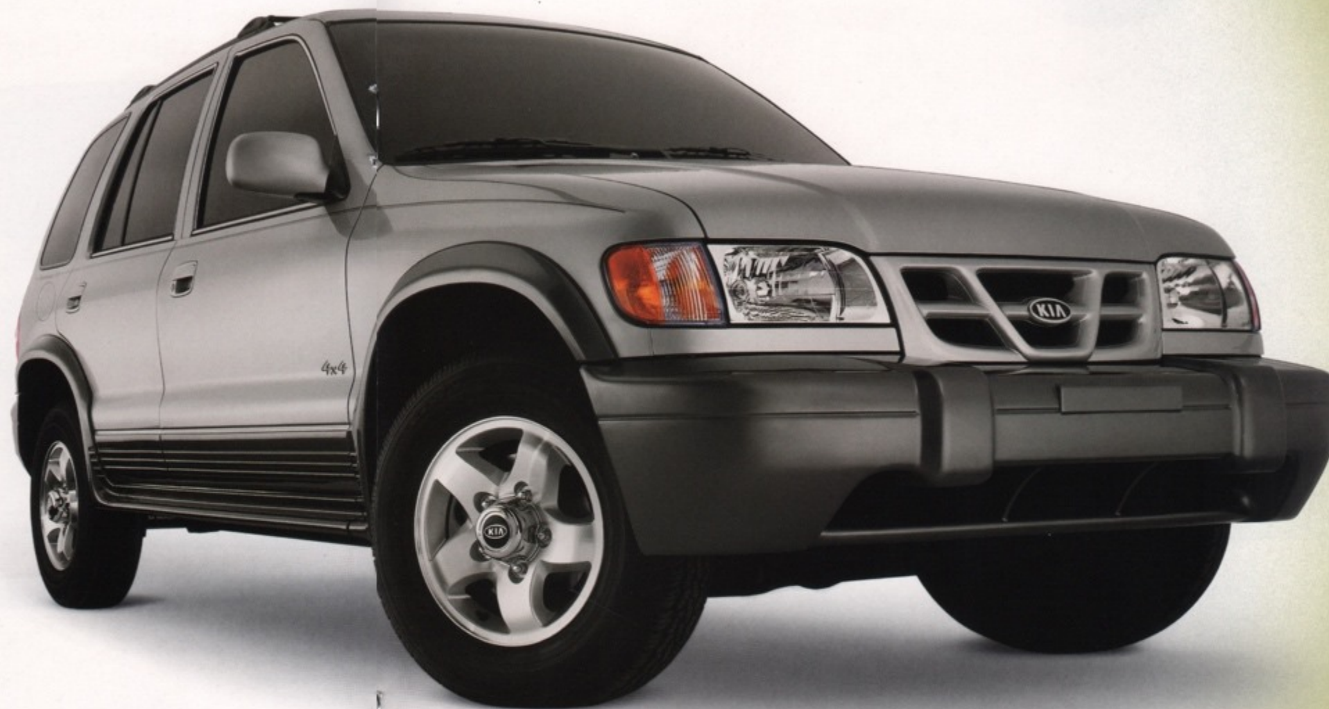
4x4 EX shown