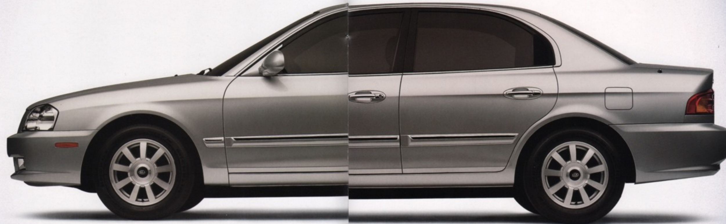
Optima SE shown