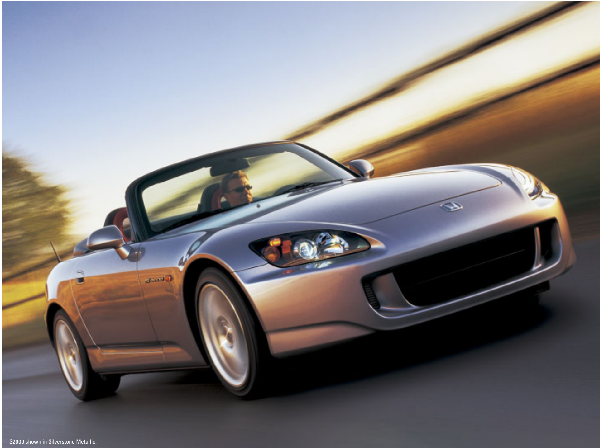
S2000 shown in Silverstone Metallic.