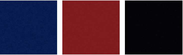
Arctic Blue Metallic 18 S/SL Cayenne Red Metallic S/SV/SL Super Black S/SV/SL

Nissan has taken care to ensure that the color swatches presented here are the closest possible representations of actual vehicle colors. Swatches may vary slightly due to the printing process and whether viewed in daylight, fluorescent or incandescent light. Please see the actual colors at your dealer.