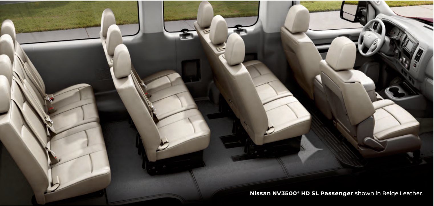
Nissan NV3500® HD SL Passenger shown in Beige Leather.