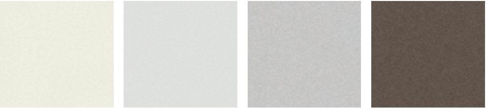
Pearl White TriCoat 17 S/SV/SL Glacier White S/SV/SL Brilliant Silver Metallic S/SV/SL Java Metallic 18 SV/SL

Commercial Upfit Allowance Incentive This option allows eligible customers to take advantage of an upfit allowance incentive. See your local Nissan Commercial Vehicles Dealer for complete guidelines surrounding the upfit allowance amounts and eligibility requirements. 11, 12