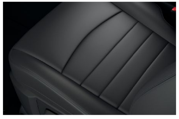
Vinyl Diesel Gray Tradesman<sup>®</sup> and Express models