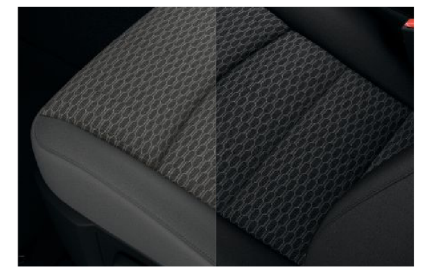
Sedoso/Alloy Cloth Diesel Gray Tradesman and Express models