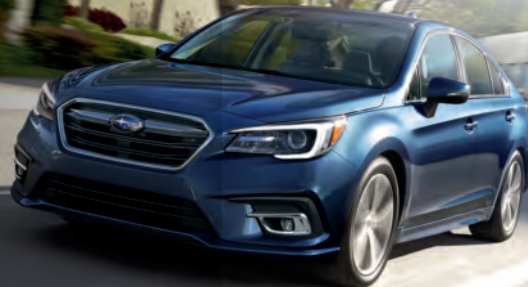
Legacy 2.5i Limited in Abyss Blue Pearl with optional equipment.