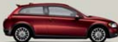
THE ALL-NEW VOLVO C30