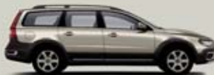
THE ALL-NEW VOLVO XC70