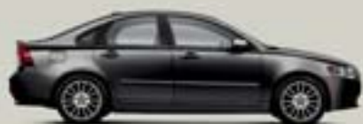
THE NEW VOLVO S40

Our origins near the magnetic north pole may not completely explain the attraction you feel looking at these beautiful cars, but every Volvo does exhibit distinct Scandinavian sensibilities. The muscular stance and sculpted lines of each exterior are fine examples of bold design. Inside, this elegant simplicity manages to reduce stress with thoughtful ergonomic details and practical amenities. Under the hoods, quiet yet powerful engines provide a feeling of safety that comes from instant acceleration. On the road, our natural tendency to avoid confrontations of any sort helps fortify our total commitment to safety. And of course, feeling safe may be the single most important reason the world's most comfortable seats are said to be found in a Volvo.