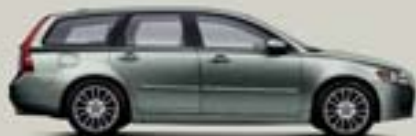
THE NEW VOLVO V50