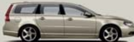
THE ALL-NEW VOLVO V70