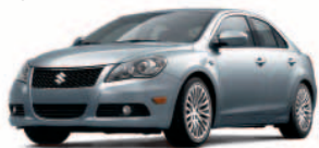
Platinum Silver Metallic