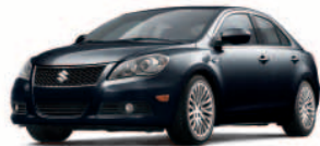
Black Pearl Metallic