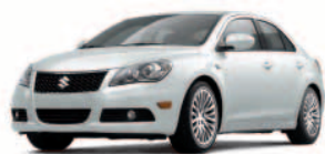
White Water Pearl