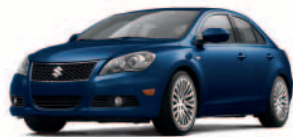
Deep Sea Blue Metallic