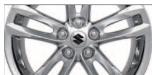
18-inch Chrome Wheels 18