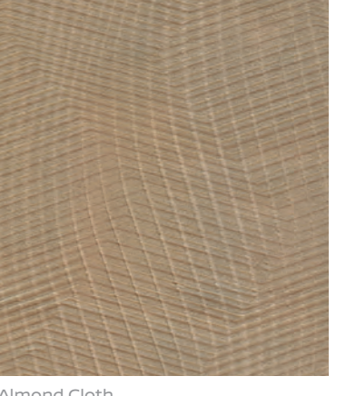
Almond Cloth SV