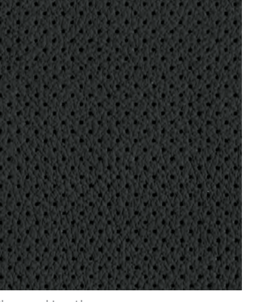
Charcoal Leather SL