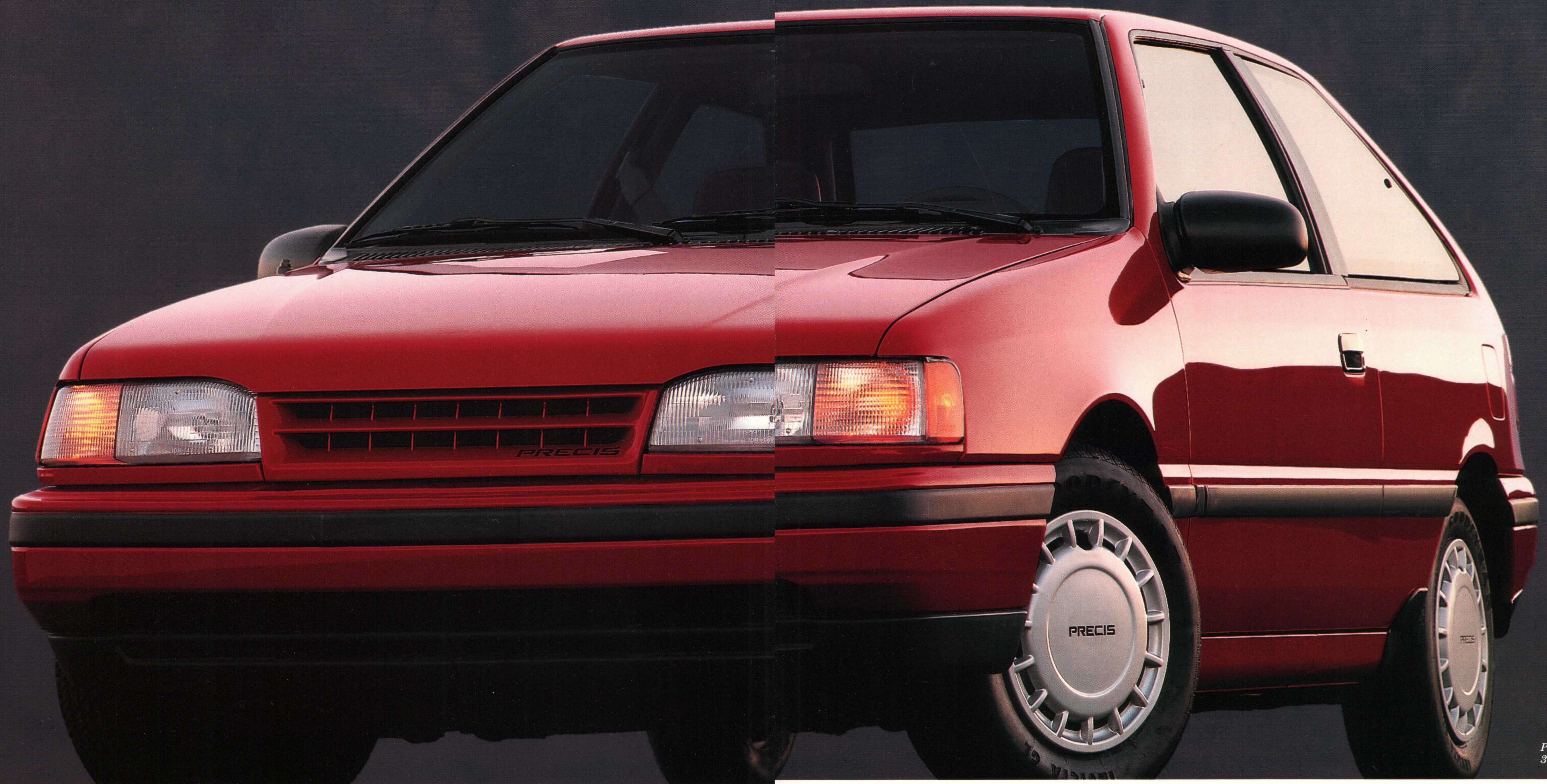
Precis RS 3-Door Hatchback