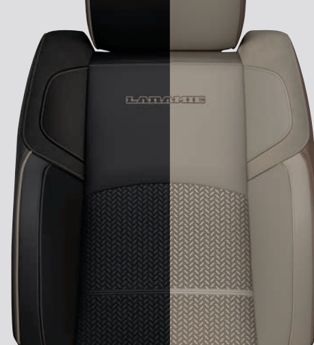
Leather-Trimmed, Black Leather-Trimmed, Light Laramie®/Laramie with Sport or Black Appearance Packages Brown Laramie

Premium Leather, Frost Beige/Mountain Cattle Tan/Black Laramie Longhorn®