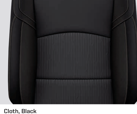
Big Horn® and included with Sport or Black Appearance Packages Optional on Tradesman