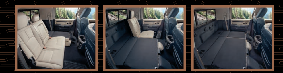
BIG SPACE, BIG THINKING. With its best-in-class interior storage<sup>2</sup>, Ram Mega Cab<sup>®</sup> is the solution for cargo best left inside; a 60/40 split-folding rear seat design gives you a flat surface in seconds—as shown by this Heavy Duty Limited model.

OF COURSE IT'S SOPHISTICATED. A Ram Limited interior stands apart–starting with more leather and real-wood interior coverage than Ford F-250/F-350 Platinum or GMC Sierra Denali 2500/3500.<sup>20</sup> In your choice of all-Black leather seating (shown above) or Indigo/Light Frost Beige (shown at right), you'll enjoy a Limited-specific instrument cluster, the highest Uconnect<sup>®</sup> system, a wireless charging pad, heated outboard rear seats, and unique wood and aluminum accents. A beautiful option: the Limited Level I Equipment Group with Surround-View Camera System with Trailer Reverse Guidance,<sup>®</sup> Forward Collision Warning Plus,<sup>®</sup> Adaptive Cruise Control with Stop,<sup>7</sup> Cargo-View Camera<sup>®</sup> and premium Harman Kardon<sup>®</sup> 17-speaker Surround Sound system.