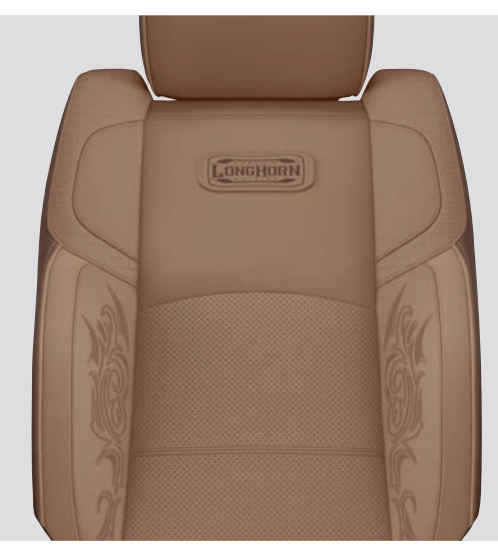
Premium Leather with Laser Etching, Light Mountain Brown/Mountain Brown Laramie Longhorn