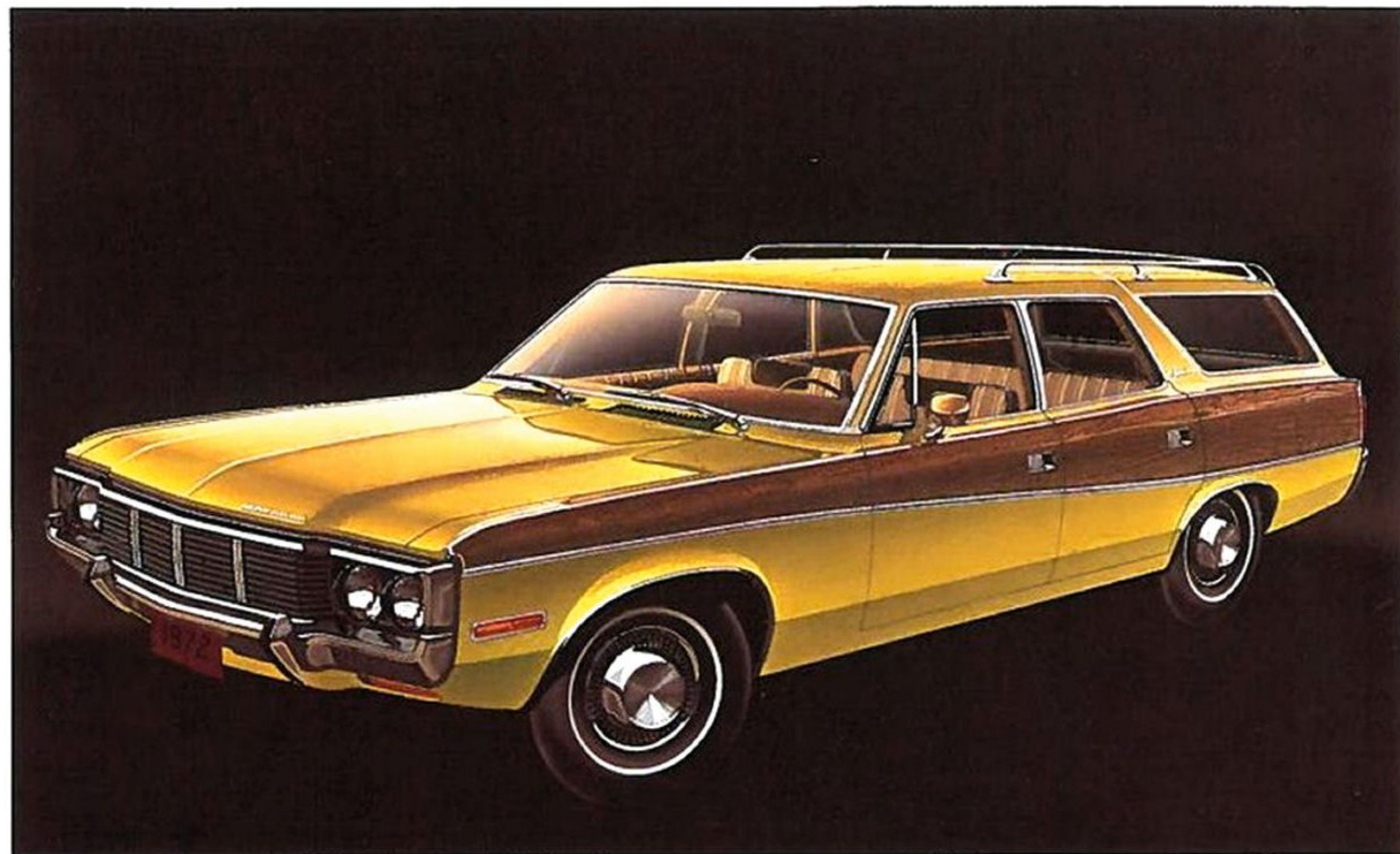
4-door wagon in Canary Yellow with optional woodgrain panels.