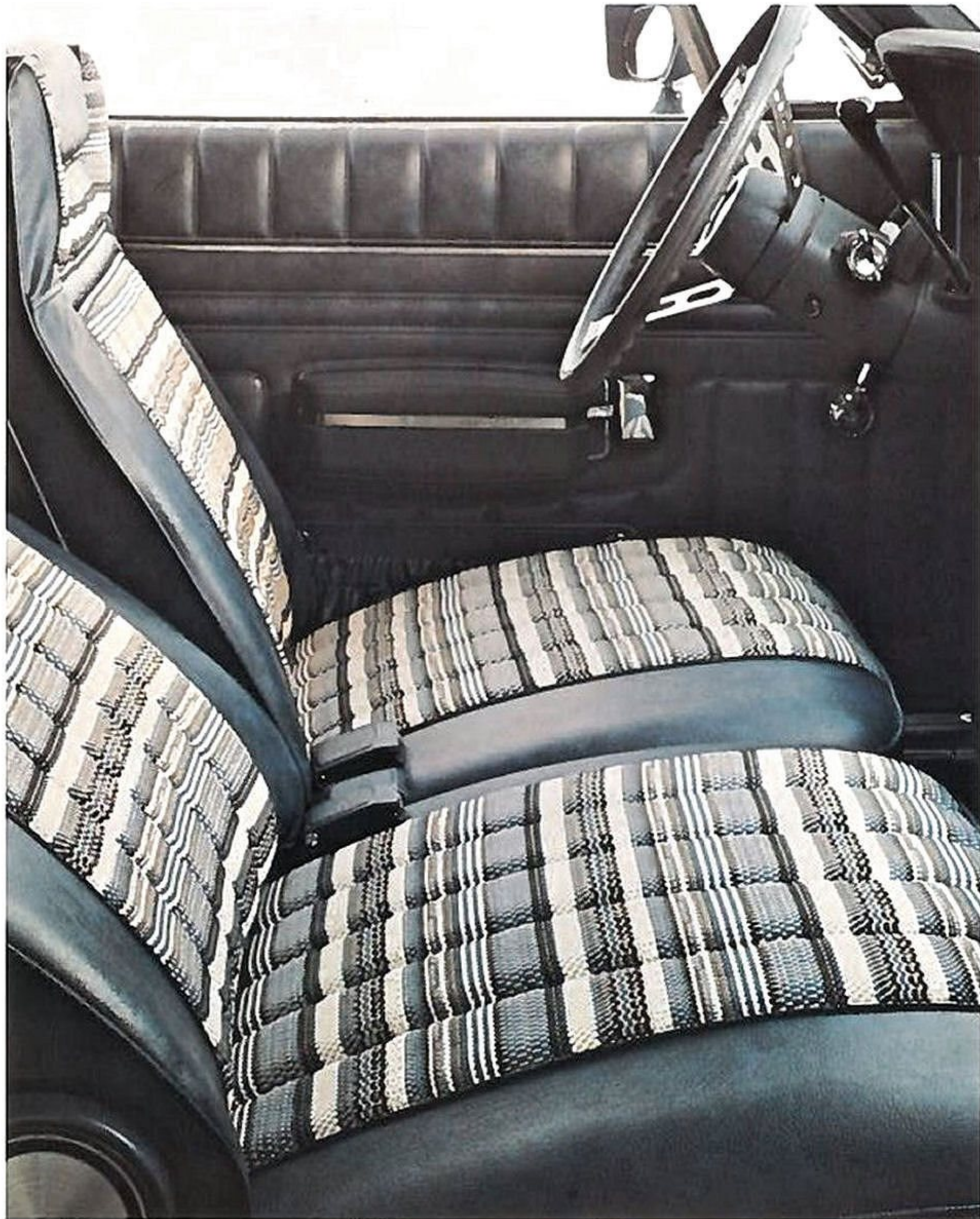
Left: Individual reclining seats (optional) available in two optional trim styles: rich, perforated vinyl and (shown in blue) custom fabric with grained-vinyl bolster.