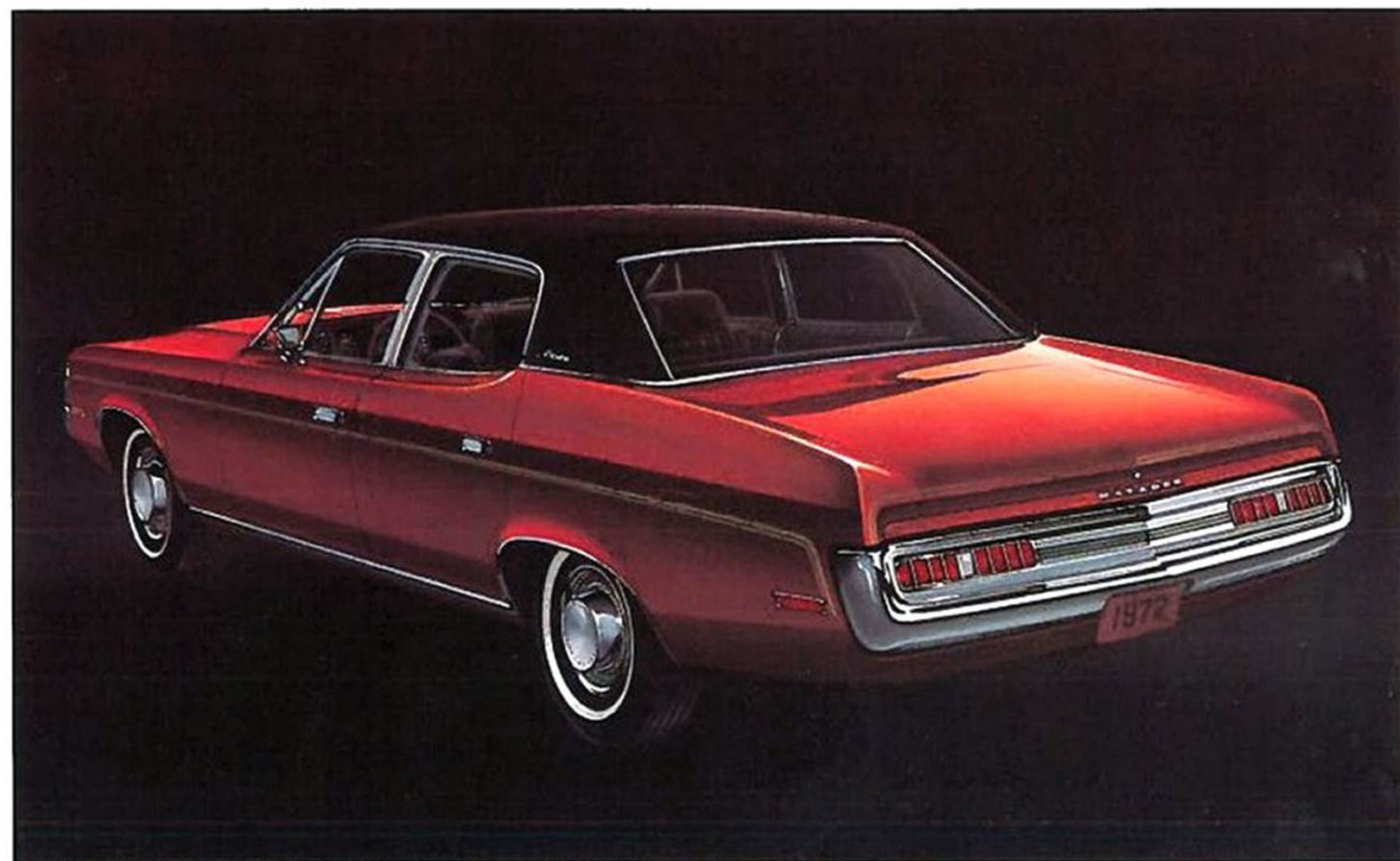
Matador 4-door Sedan in Sparkling Burgundy with standard double body side stripes.