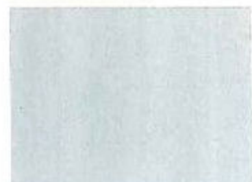
Ice Blue Metallic Clear Coat