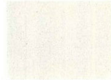
Radiant Silver Clear Coat