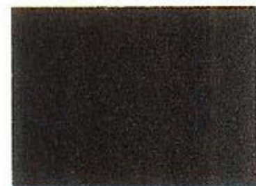
Charcoal Gray Metallic Clear Coat