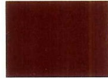
Garnet Red Metallic Clear Coat