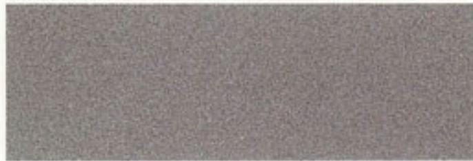
Symphonic Silver Metallic