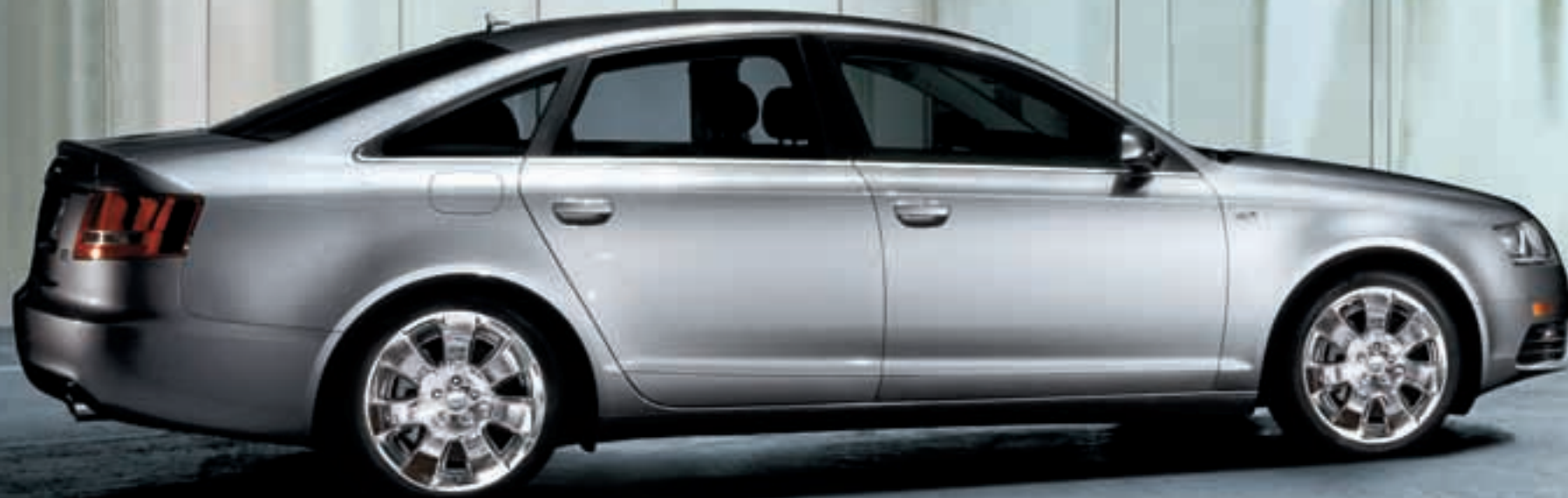
A6 3.2 Sedan & Avant