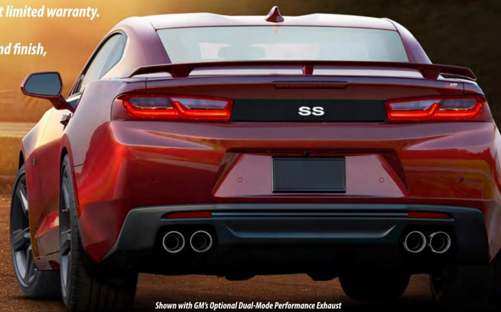
Shown with GM's Optional Dual-Mode Performance Exhaust

Our OE-quality components deliver high-quality fit and finish, with performance and styling enhancements second to none. From our Carbon Fiber hood (optional) and unique exterior and interior badging, to our world-class supercharger, Specialty Vehicle Engineering vehicle packages provide unmatched performance that will impress you from the moment you start the engine.