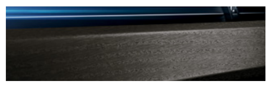
High-gloss Burl Walnut Wood