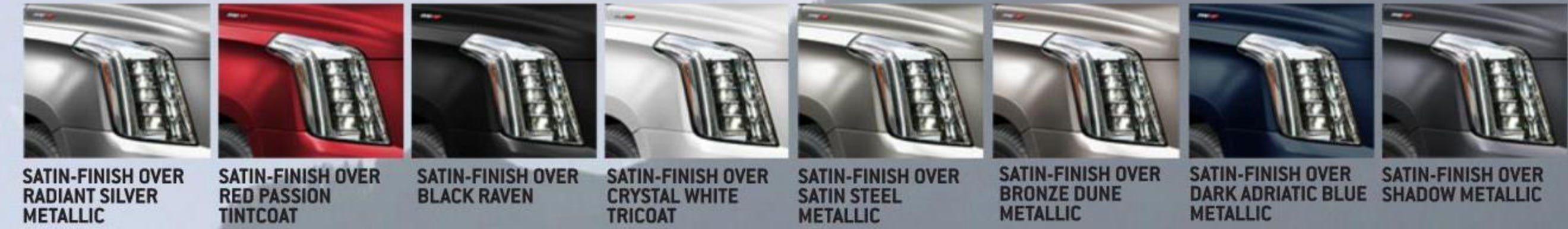
SATIN-FINISH OVER RADIANT SILVER METALLIC

This optional paint treatment uses an OE-quality satin-finish clearcoat paint over the factory exterior paint, giving it a unique satin-finish appearance while maintaining the vehicle's stock factory body color. Looks great over all factory Escalade colors. This paint treatment option is covered by our 3 year/36,000 mile limited warranty.