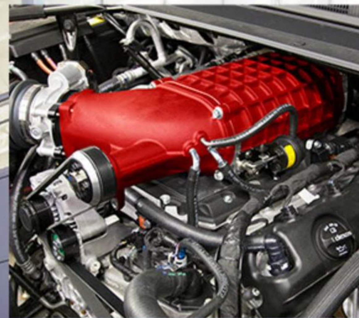
Specialty Vehicle Engineering's High/Output Series supercharged engine with 810 horsepower and 770 lb.-ft of torque makes this 2019 Escalade one of the fastest SUVs on the road. Shown with optional supercharger paint (black is standard).

*Not emission legal in California and can only be legally used while participating in sanctioned motorsports racing events.