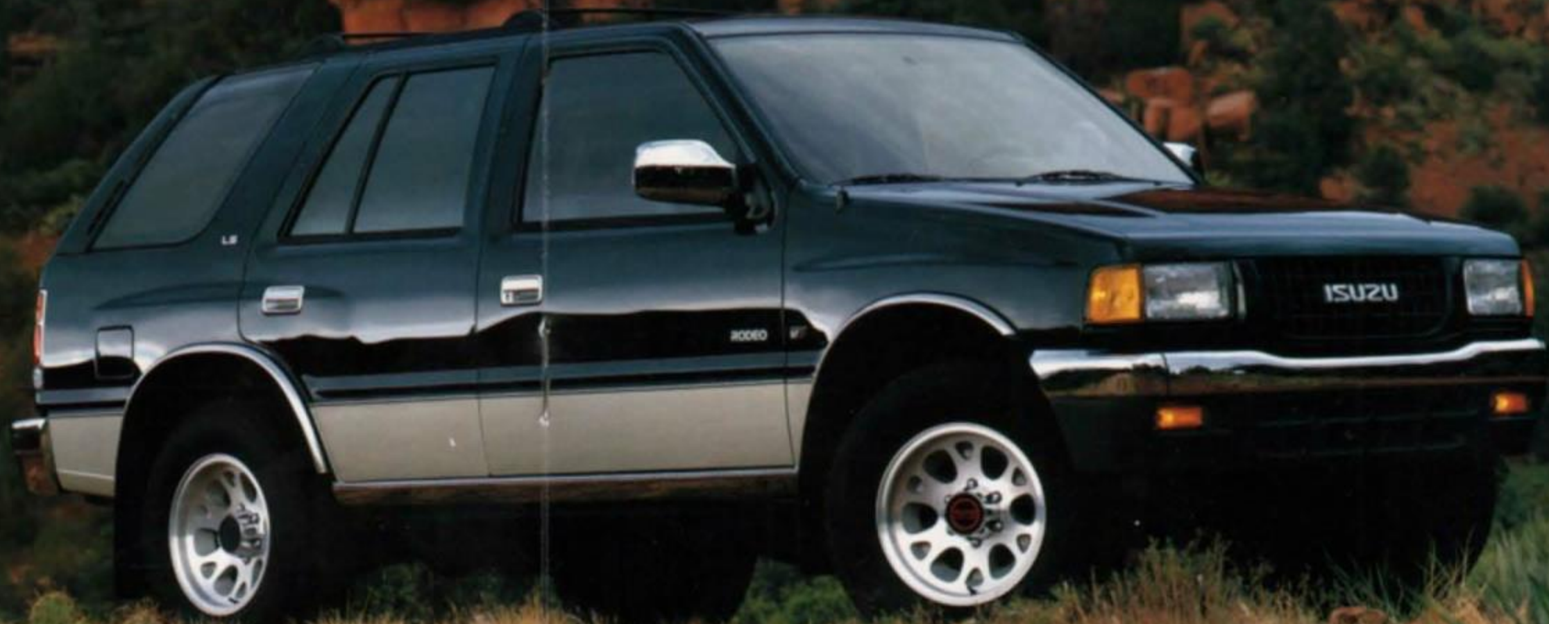
RODEO LS 4WD