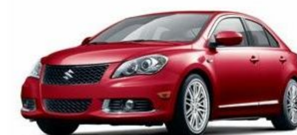
Ablaze Red Metallic