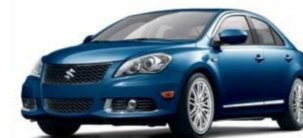
Prussian Blue Metallic