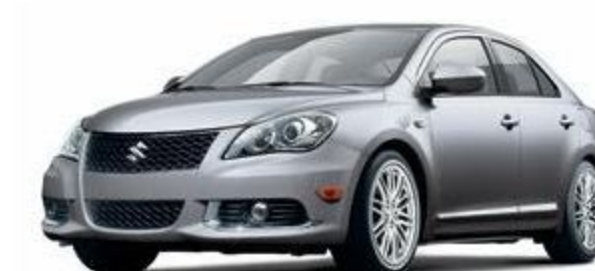
Premium Silver Metallic