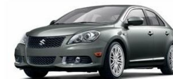
Azure Gray Metallic