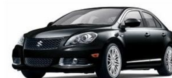
Black Pearl Metallic