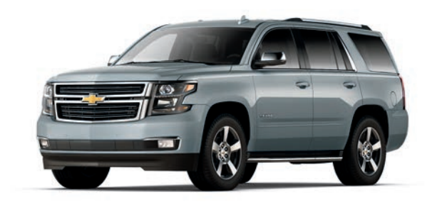
Satin Steel Metallic