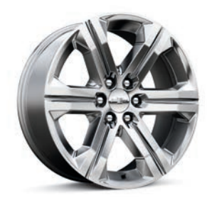
22" Chrome-Aluminum Wheels (SMI) Available on LT and Premier