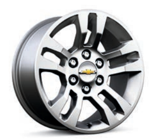
18" Aluminum Wheels with High-Polished Finish (PZX) Standard on LS and LT