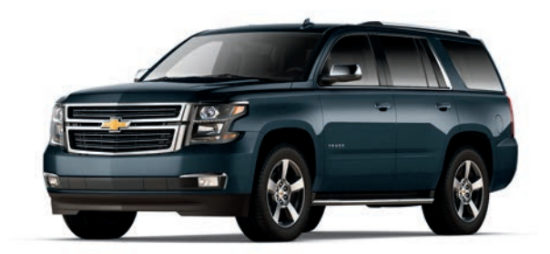
Shadow Gray Metallic