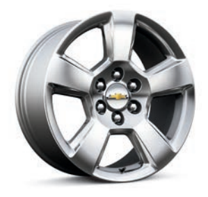
20" Polished-Aluminum Wheels (RD4) Standard on Premier; available on LS and LT