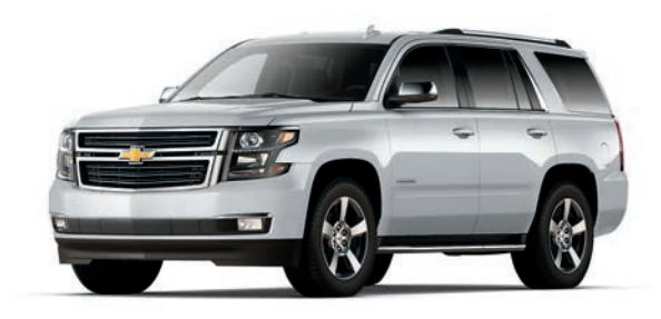
Silver Ice Metallic