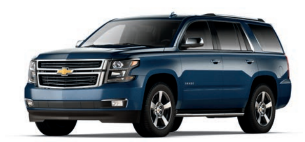
Blue Velvet Metallic