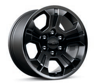
18" Black-Painted Aluminum Wheels (REG) Available on LS<sup>3</sup> and LT<sup>4</sup>