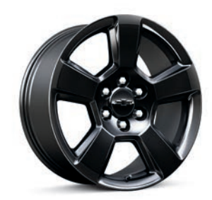
20" Black-Painted Aluminum Wheels (NZQ) Available on LT<sup>5</sup>