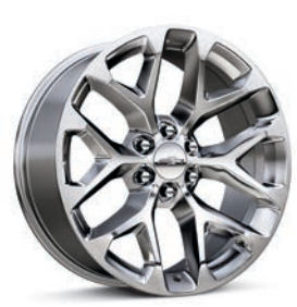
22" Chrome-Aluminum Wheels with Multi-Featured Design (RPT) Available on LT and Premier