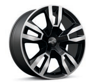
22" Gloss Black-Painted Aluminum Wheels with Custom Silver Accents (SGK) Available on LT<sup>6</sup> and Premier<sup>6</sup>