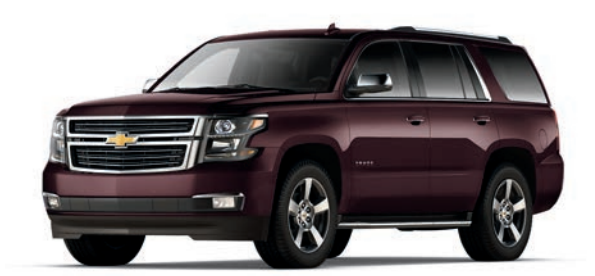
Black Cherry Metallic<sup>1,3</sup>