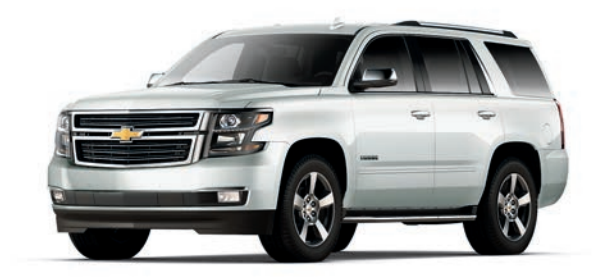
Iridescent Pearl Tricoat<sup>1,2</sup>