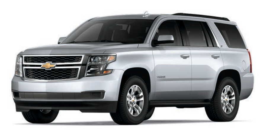
LT In addition to or replacing LS features, LT includes: