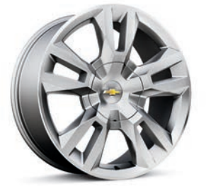
22" Bright Machined-Aluminum Wheels with Bright Silver Finish (SIY) Available on Premier