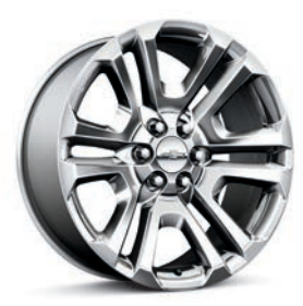
22" Split 6-Spoke Chrome-Aluminum Wheels (SEU) Available on Premier<sup>7</sup>