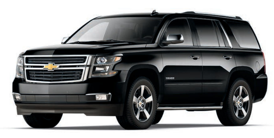
PREMIER In addition to or replacing LT features, Premier includes: