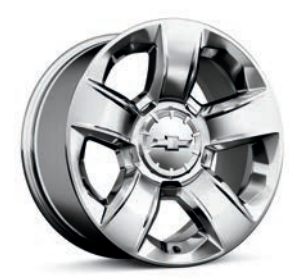
20" Chrome-Aluminum Wheels (RD2) Available on Premier