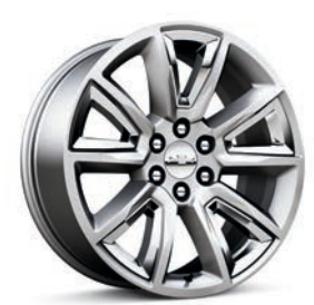
22" Premium Painted-Aluminum Wheels with Chrome Inserts (SGF) Available on LT and Premier