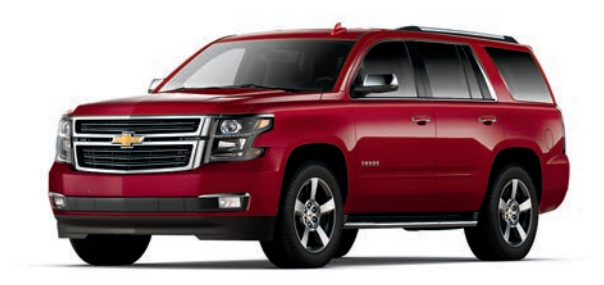
Siren Red Tintcoat<sup>1</sup>