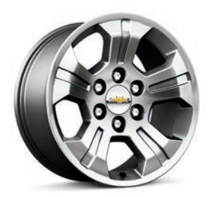
18" Painted-Aluminum Wheels (RCV) Available on LS¹ and LT²