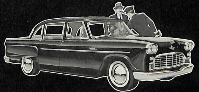
CHECKER MARATHON 4 door sedan Station wagon also available.

And so: Checker offers a dignified, timeless, intelligently styled car with all the comfort, performance and durability features that appeal to the common sense car buyer. Checker's improvements mean advancements without obsolescence, thus making your automotive investment more secure.