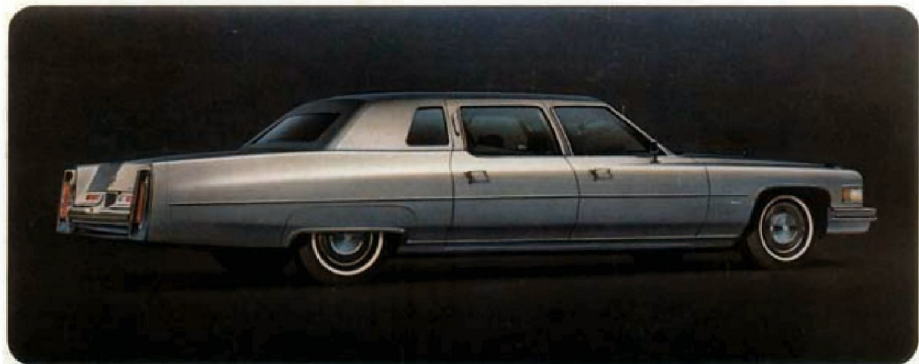
1975 Cadillac Limousine in Georgian Silver Metallic.