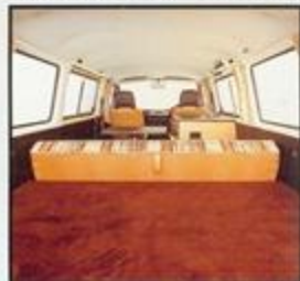
1. Rear-to-front view, showing bed conversion, in seat position.

The Weekender offers total versatility. It's a second car plus a capable weekend home. Standard Equipment: King Size Seat-to-Bed Conversion—Cabinet with Stainless Steel Sink—Ice Box—Carpeted Floor—Fresh Water Tank—Collapsible Waste Tank—Manual Water Pump—Fluorescent Galley Light—Drapes All Around—Screened Windows—Front Seat Covers—Wired for 110 Volt with 15 Amp Breaker—Table—Dashboard Snack Tray—Fire Extinguisher.