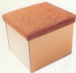
Removable Ottoman —versatile seating unit, and alternative cover for portable toilet.