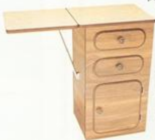
Galley Cabinet —optional extended storage and counter space for Camper and Weekender models. Shown with optional woodgrain finish.

Awning —6' x 8' protective overhead extension to side of camper.