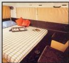
1. King size bed in fold down position.

This neat combination can be a station wagon, family car, or an overnighiter. It is an inexpensive and unique way to seat seven or sleep two with the added touch of a warm interior and privacy drapes. Standard Equipment: King Size Bed—Front Seat Covers—Carpeted Floors—Drapes—Window Screens—Two Rear-Facing Seats—Table—Dash Snack Tray.