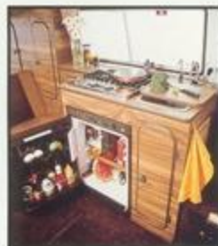
1. Kitchen cabinet with sink, stove and refrigerator. Shown with optional wood grain finish.

The Camper is the ideal family unit with emphasis on sleeping capacity and total utilization of space. Years of customer acceptance and experience have resulted in this complete home away from home. Standard Equipment: Penthouse Top—Seat-to-Bed Conversion—Front Seat Covers—Carpeted Floor—Cabinet with Stainless Steel Sink—Electric Pump, Manual Backup—Collapsible Waste Tank—Fresh Water Tank—Hook-up for City Water—10/12 Volt/LP Gas Refrigerator—Dual Battery with Isolator—Two Burner Stove—11C/12 Volt Converter with Built-in Battery Charger—Table—Screened Windows—Fluorescent Galley Light—Reading Lights—Drapes all Around—Dashboard Snack Tray—Fire Extinguisher.