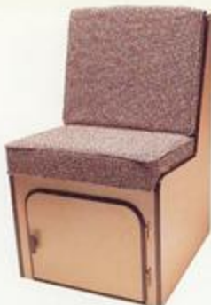
Stationary Seat with storage area for portable toilet. Attractive dual-purpose unit with seat belts.