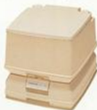
Portable Toilet —convenient and compact necessity.