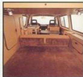
2, 3. Rear-to-front view, showing bed conversion and storage units.