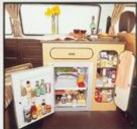
2. Kitchen cabinet with ice box and sink.