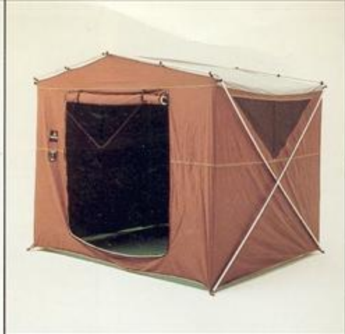
Tent attaches to camper, or use free-standing (save your campsite while away in your camper); sturdy, and simple to erect. 7' x 8' floor space, 6' wall height.