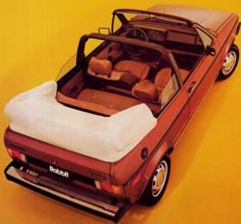
Rabbit 4-seater Convertible. Shell Brown Metallic. Interior: Gazette leatherette, top, Sand.