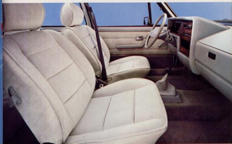
Good looking new interior, 1981 Rabbit 'LS', Silver Gray velour cloth. Head restraints are adjustable.

One reason for Rabbit's generous interior room is front wheel drive. Another is the fact that Rabbit's engine is mounted transversely (sideways) between the front wheels. So there's less engine compartment and more passenger compartment. For responsiveness and quick handling. Rabbit has rack and pinion steering. And to soak up road irregularities, there's four-wheel independent coil spring suspension.