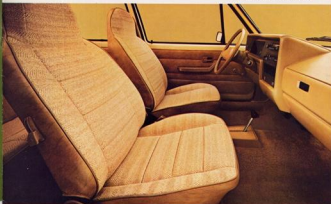
Handsome Rabbit interior with flat woven cloth seats.

Front wheel drive with transverse-mounted engine—the key to Rabbit's space efficiency—has been refined and fine-tuned by VW engineers for six years. Today other manufacturers are coming to realize the value of this configuration. And some are just beginning to introduce it on their cars.