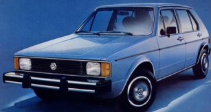
Rabbit 'LS', 4-door hatchback, Lago Blue