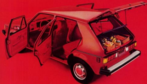
Rabbit 'L' interior, Russel Vinyl (optional). Trunk holds a generous 14 cubic feet.

You'll find Rabbit's full-size spare stowed out of the way in its own special compartment beneath the floor of the spacious cargo area. You can substantially increase the cargo space by folding down the rear seatback.