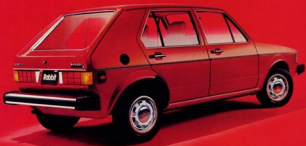
Rabbit 'L', 4-door hatchback, Royal Red.