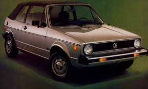
4-passenger Rabbit Convertible. Diamond Silver Metallic exterior. Black leatherette interior. Black top.

In fact, our Rabbit Convertible is quite unlike anything else you can own.