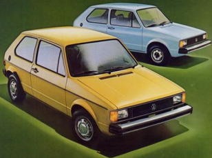
Background, Rabbit hatchback, Logo Blue. Foreground, Rabbit "L" 3-door hatchback, Sunbrite Yellow.