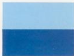
Guinea Blue over Cornal Blue