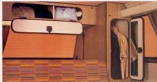
Roof storage and wardrobe with large mirror are standard.