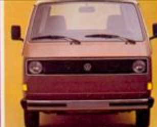
A fresh look from stem to stern.