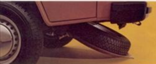
Up-front, under-floor spare tire storage—more room inside.