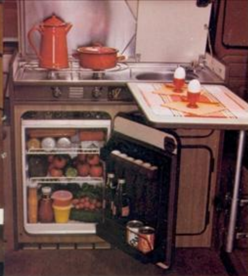
Model P27 has a 3-way refrigerator and a 2-burner cookstove.