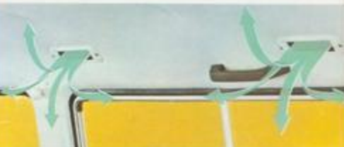
New adjustable ceiling vent louvers on left and right sides.*