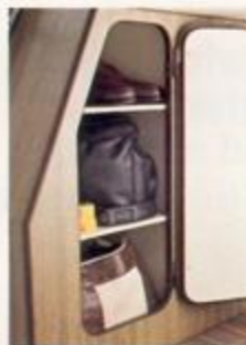
Three-level rear closet.

Before you head for the great outdoors, take a close look at Vanagon Camper. You may find you're ready to take along a very commodious companion.