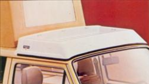
Additional storage in roof rack over cab.