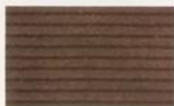
Van Dyck cloth*

Available with Bright Orange/Ivory, Assuan Brown/Samos Beige, Bamboo Yellow/Ivory, Agate Brown/Ivory, Ivory/Ivory, Cornal Blue/Guinea Blue