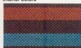
Van Dyck cloth