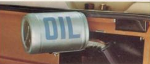
Oil filler neck slides up for easy access.