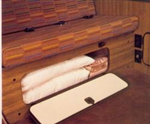
Bedding stores below rear seat.