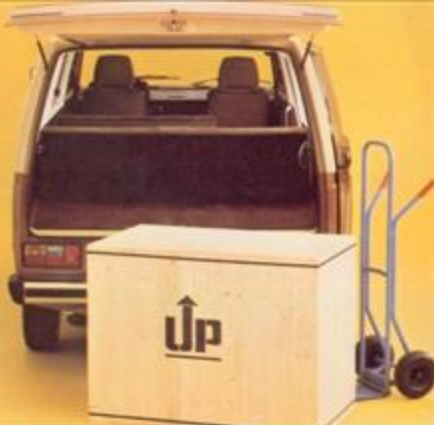
Carton measures 45" W, 34" H, 25" D, fits easily behind third seat.