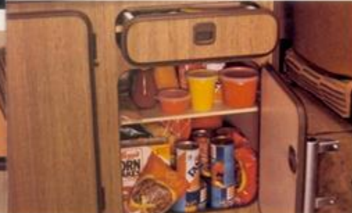
Kitchen drawer and pantry hold a lot.