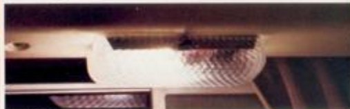
12V light over sink, standard.