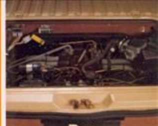
Easy engine access through large rear hatch.