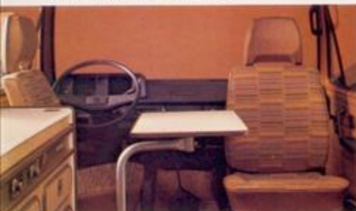
Swivel seats and swivel table, both standard.