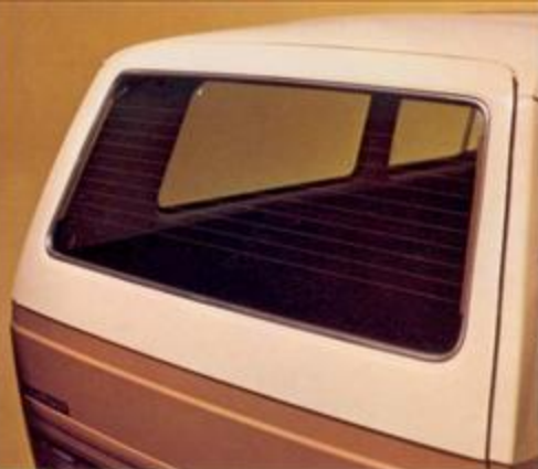
Electric rear window defroster is standard.