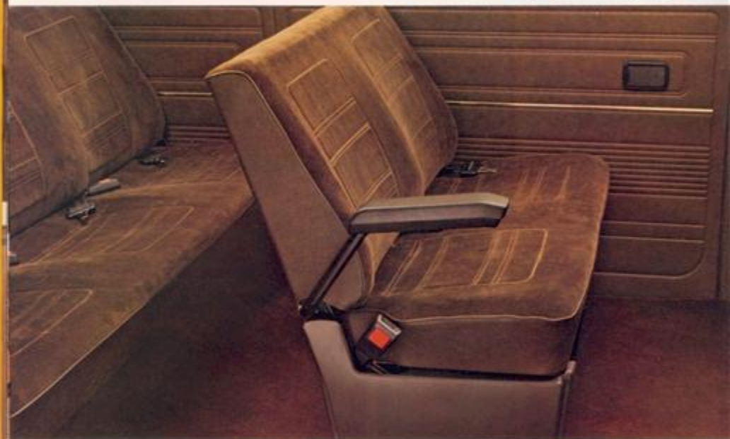
Center seat in Van Dyck cloth. Seat is easily removed when you need extra cargo room, and re-installed in minutes.

Speaking of reliability, Volkswagen has built over five million van-type vehicles. In fact, we pioneered the whole van concept over 30 years ago. Out of all this experience comes Vanagon. Quiet, sure-footed, and sleek.