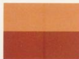
Samos Beige over Assuan Brown