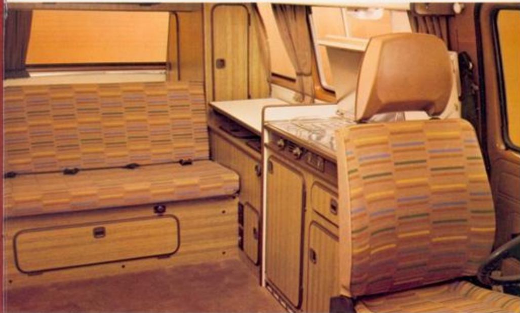
Deluxe (P27) interior, has 2-burner stove and 3-way refrigerator. Seating is Gazelle and Van Dyck cloth.

What's the difference between our two camper models? Mostly it's cooking the meals and storing them. The more luxurious P27 comes with a 3-way refrigerator and a 2-burner propane stove; P22 has a large, economical icebox.