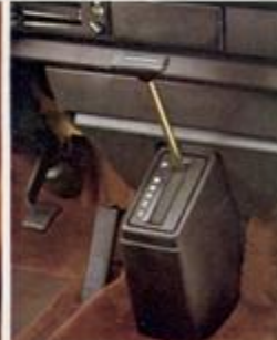
Automatic transmission, optional on all models.

VW Vanagon® Camper – convenient storage... running water... hot and cold meals... two roomy double beds.