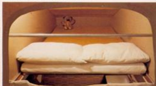
Upper double bed. Enough headroom here.