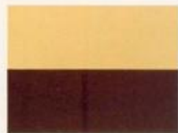
Ivory over Agate Brown