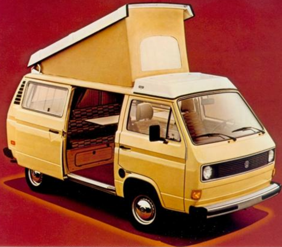
Vanagon® Camper, Ivory. Seating fabric is Van Dyck and Gazelle cloth.