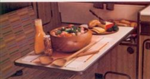
Large rear swivel table. Salad is served!