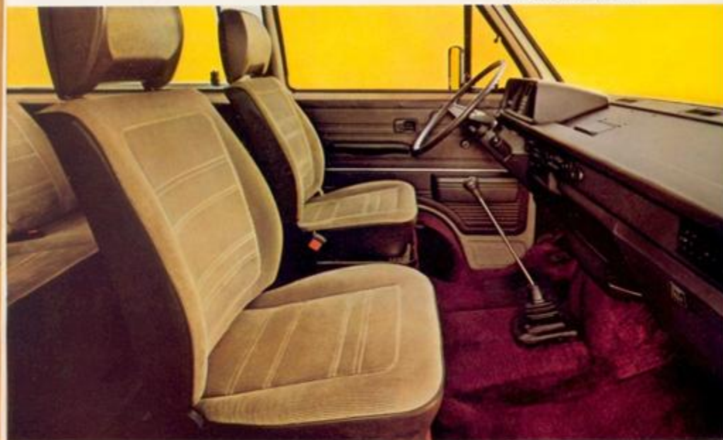
Vanagon® "L" interior, Topaz cloth. Ask your dealer about availability.

suspension smoothes your ride, whether fully loaded or completely empty. In the 7-seater, there's a wide aisle between the front bucket seats. So you can move quickly and easily to the middle or the rear.