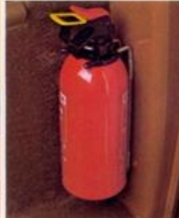
Fire extinguisher is standard on Model P27.