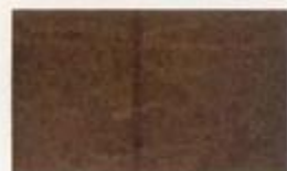
Van Dyck leatherette

Available with Bright Orange/Ivory, Assuan Brown/Samos Beige, Bamboo Yellow/Ivory, Agate Brown/Ivory, Ivory/Ivory, Cornal Blue/Guinea Blue