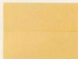
Ivory over Ivory