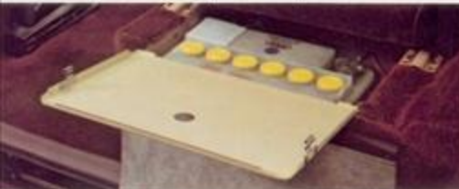
Easy battery access under passenger seat.