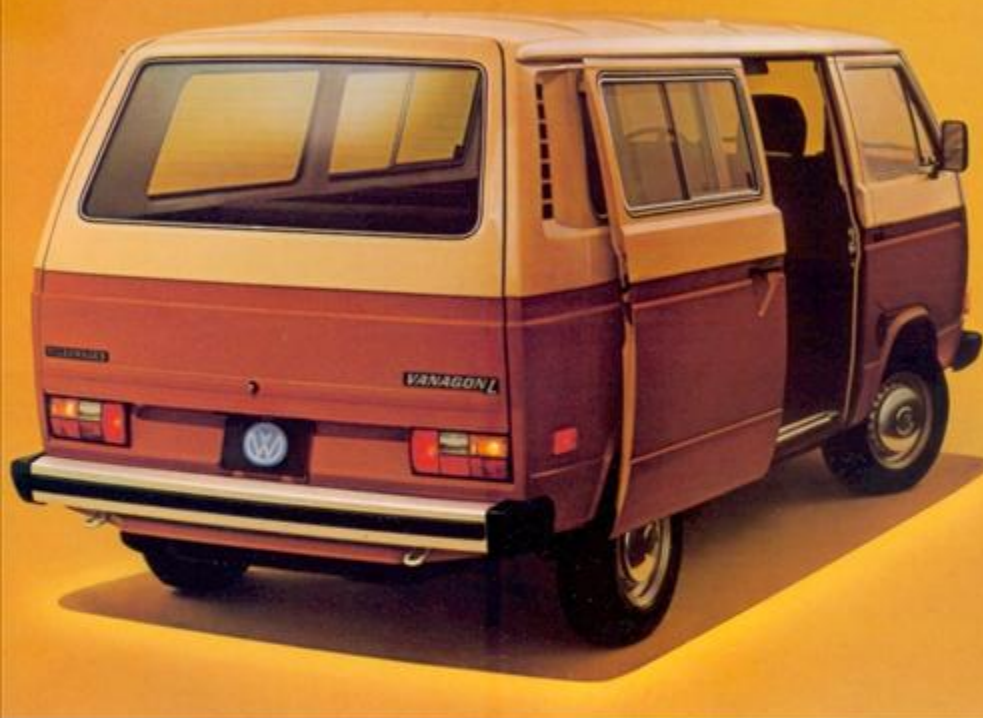
Vanagon® "L", Assuan Brown with Samos Beige. Large hatchdoor, low sill make loading easier.