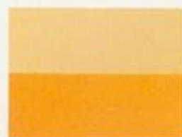
Ivory over Bamboo Yellow