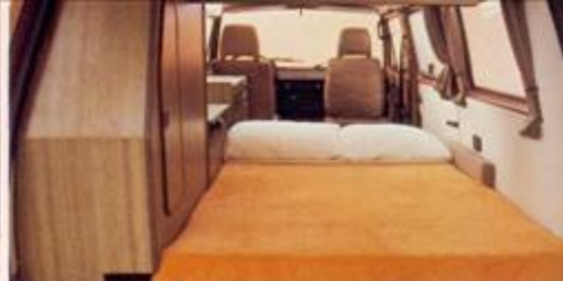
Lower double bed. Add your own bedding.