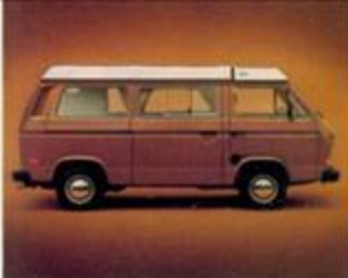
Vanagon Camper, Assuan Brown