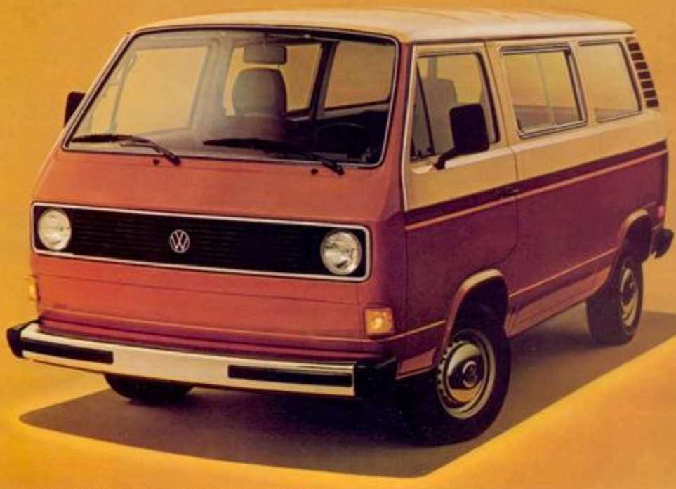
Vanagon® "L", Assuan Brown with Samos Beige top. One of six standard two-tone exteriors