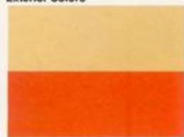
Ivory over Bright Orange