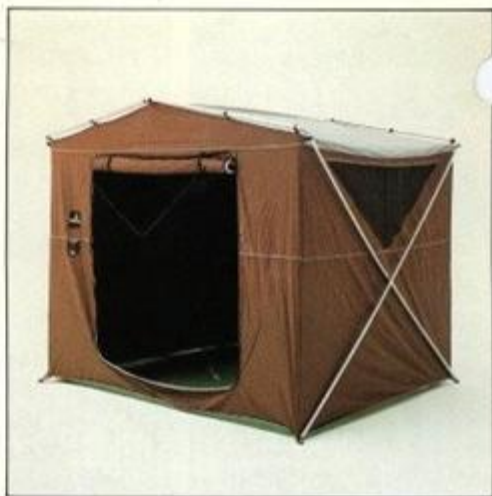
Tent attaches to camper, or use free-standing (save your campsite while away in your camper); sturdy, and simple to erect. 7'x8' floor space, 6' wall height.