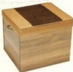
Ottoman —versatile seating unit, and alternative cover for portable toilet.