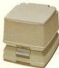
Portable Toilet —convenient and compact necessity.