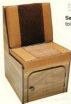
Seat with storage area for portable toilet. Attractive dual-purpose unit.