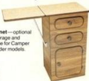
Galley Cabinet —optional extended storage and counter space for Camper and Weekender models.