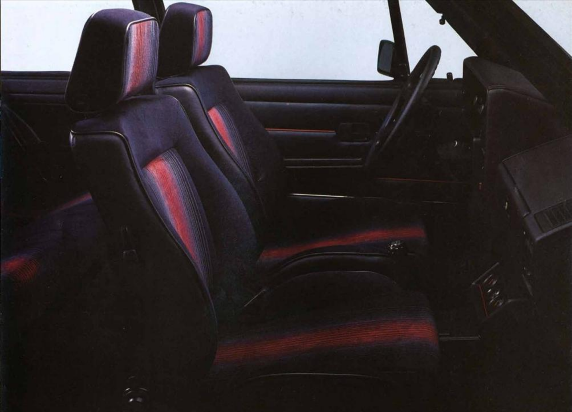
Blue with red striped velour GTI interior.