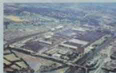
Volkswagen World Headquarters in Wolfsburg, West Germany.

Isn't it nice to feel secure in your decision to drive a new Volkswagen?