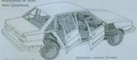
Quantum—precise German engineering—superb automotive technology at its finest.

For greater peace-of-mind enjoyment of your new Quantum,