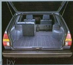
Accommodate extra long payloads with Quantum Wagon's standard split rear seat.