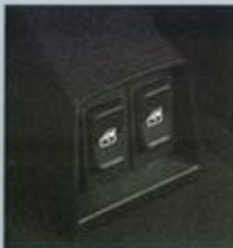
Cruise control, an AM/FM stereo cassette radio and power windows are all standard on the Quantum GL Sedan.