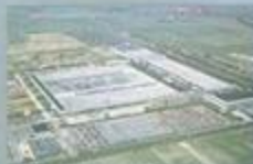
Quantum manufacturing facilities in Emden, West Germany.

Isn't it nice to feel secure in your decision to drive a new Volkswagen?