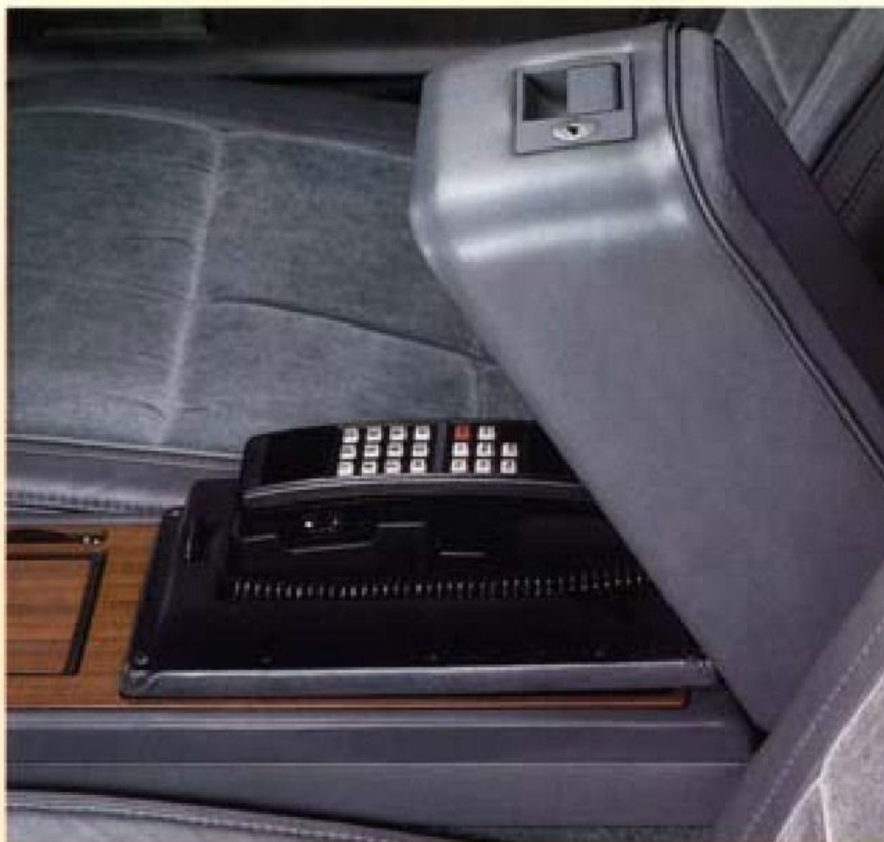
New Cellular Telephone