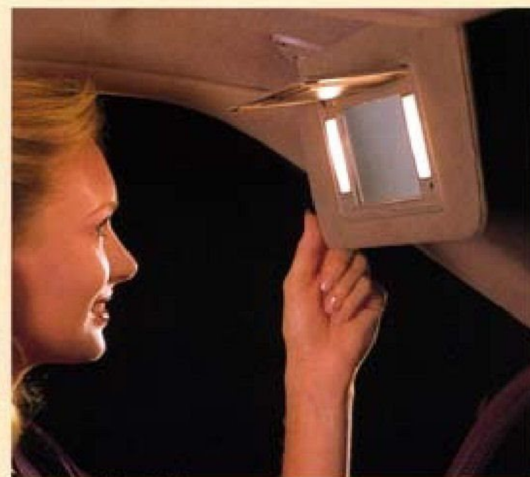
Illuminated Vanity Mirror.