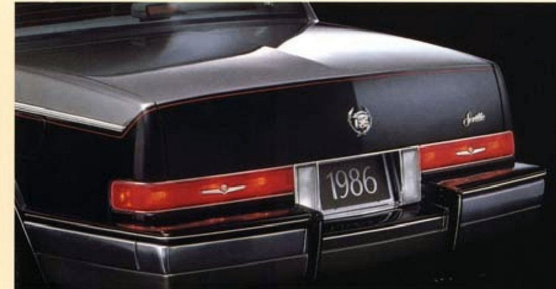
New Wraparound Taillamp Design.

New Front-Floor Console. Includes automatic transmission shift selector, fold-down armrest, two storage compartments, optional cassette storage, rotating cup holder, coin holder and more.