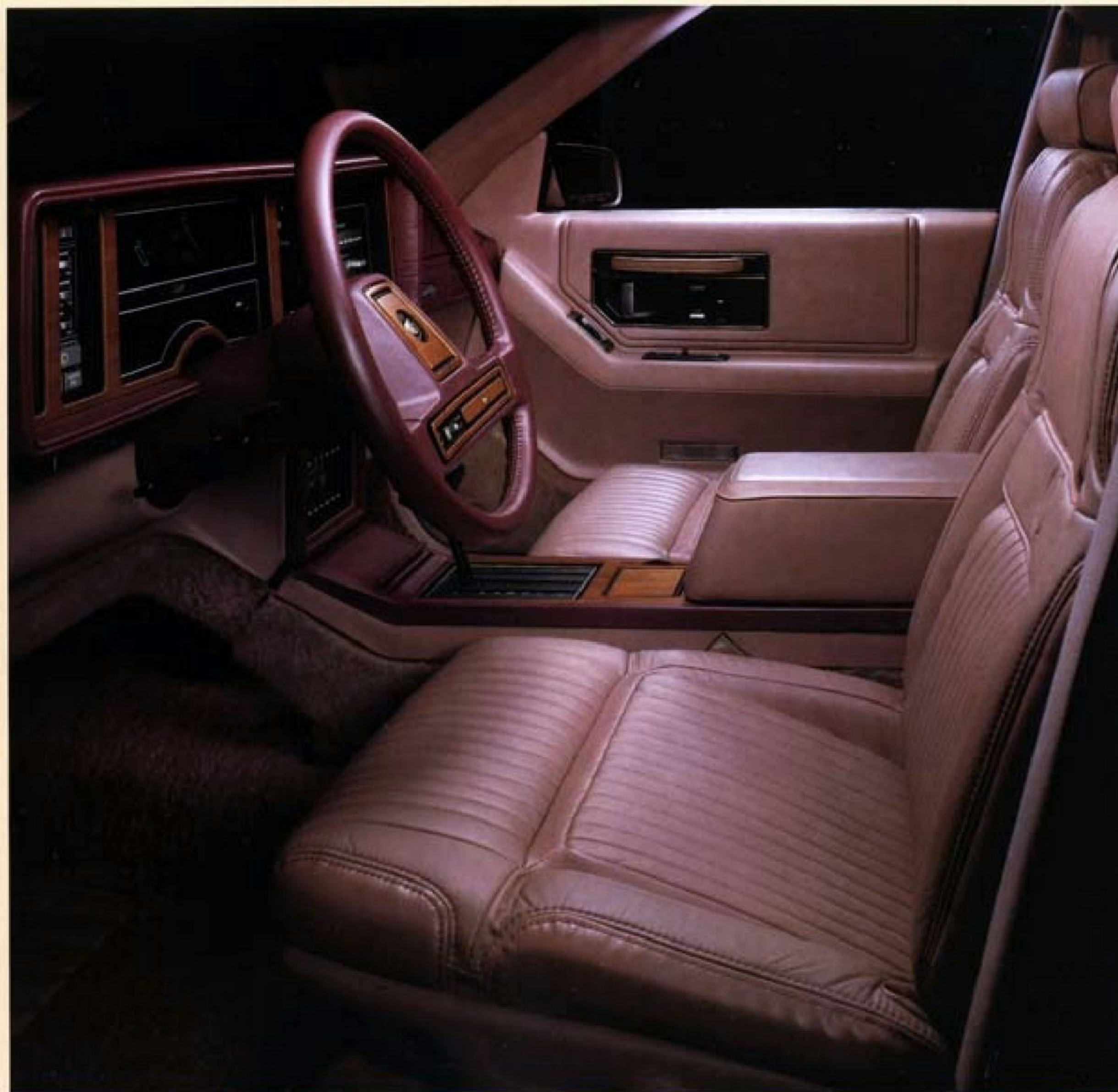
Interior shown with available Quartz leather seating areas.

Genuine American walnut adds a finishing touch to the instrument panel, steering wheel and console.