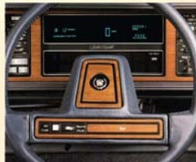
Genuine American Walnut Trim.