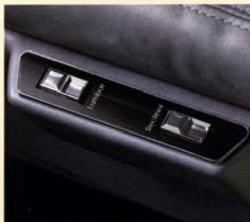
Power Lumbar Support for driver and front passenger on Elegante.