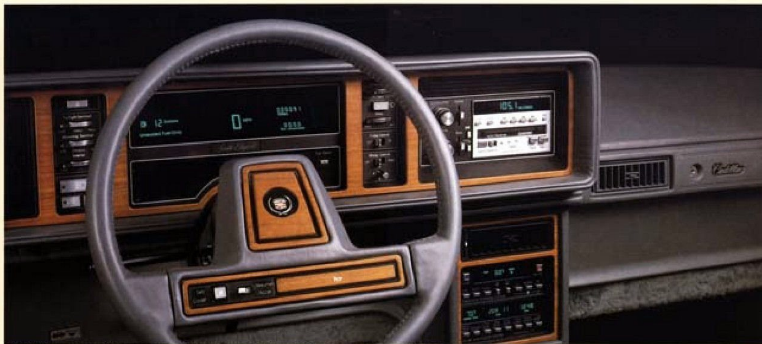
Digital Instrument Cluster and Leather-Trimmed, Tilt-and-Telescope Steering Wheel.