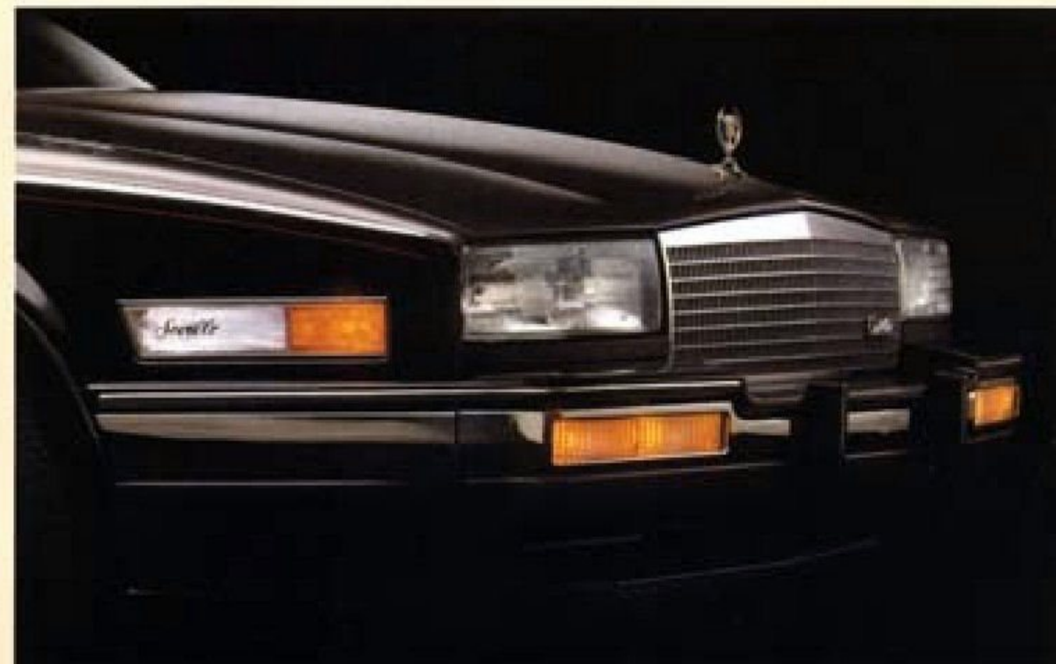
Tungsten Halogen Composite Headlamps and Front Cornering Lights; Front and Rear Lamp Monitors.