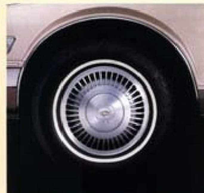
Aluminum Alloy Wheels.