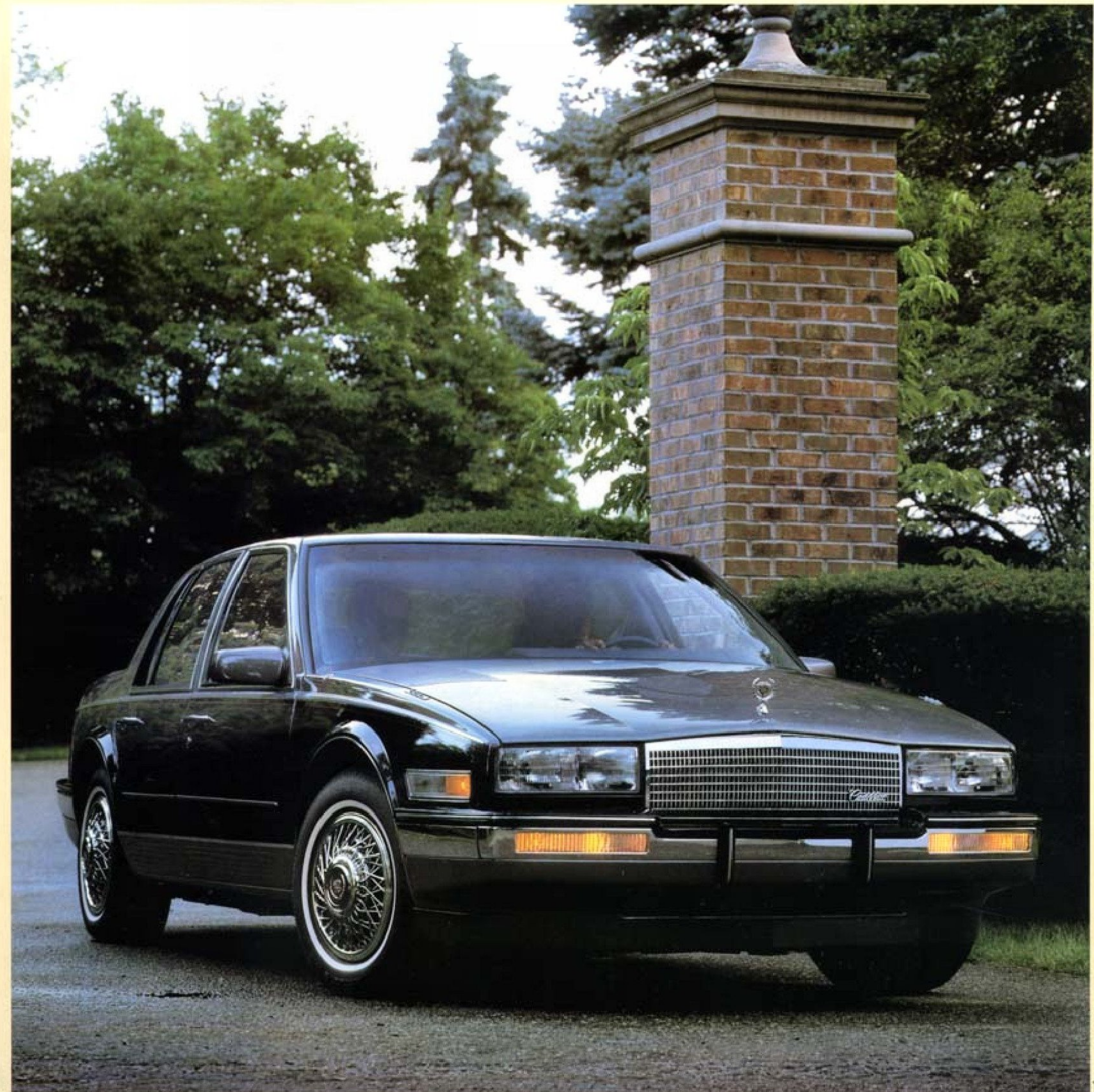
1986 Seville Elegante shown in Academy Gray and Sable Black.

Is it any wonder driving a new Cadillac is a pleasure to be envied?