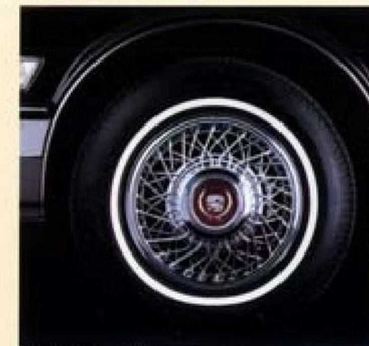
Wire Wheel Disc.

Security Option Package. Includes Illuminated