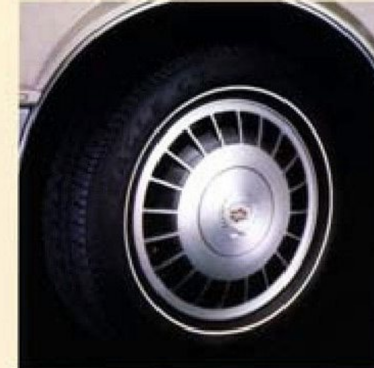
15" Aluminum Alloy Wheel and Goodyear Eagle GT Tire.

Entry System, Remote Fuel Filler Door Lock, Automatic Door Locks and Theft-Deterrent System.