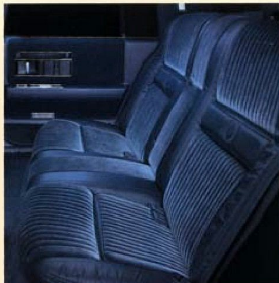
Royal Prima cloth and leather combination seating areas offered in four different colors.