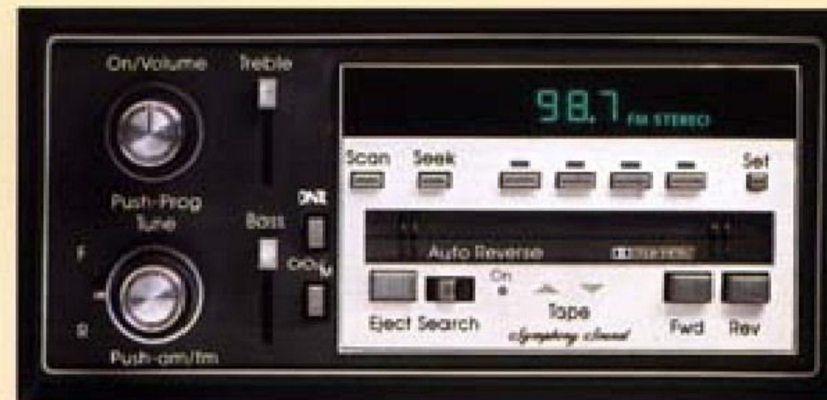
Delco-GM/Bose Symphony Sound System.