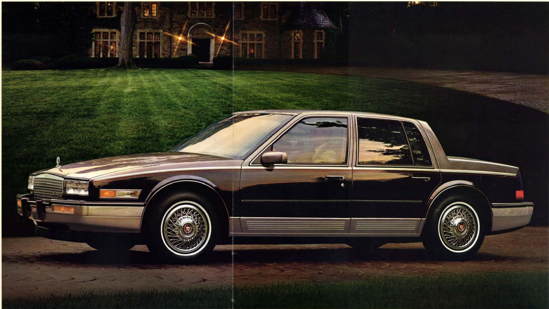
1986 Seville Elegante shown in Academy Gray and Sable Black.

And the optimum Seville is pictured here. Seville Elegante. For 1986, the Elegante distinguishes itself with an exclusive new mid-tone paint treatment that's complemented by upper body accent molding and wire wheel discs.