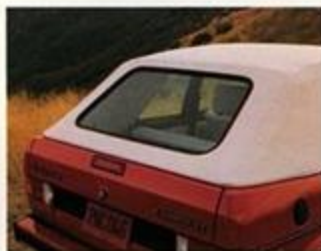
An electrically heated rear glass window is standard on Cabriolet (Best Seller model shown).

No wonder this Cabriolet moves out of the showroom so quickly. Its special color coordinated looks make this a guaranteed "Best Seller." It offers all of the same standard equipment as the Cabriolet plus body colored bumpers and mirror housings, unique sport design cloth bucket seats, sporty alloy wheels, and more.