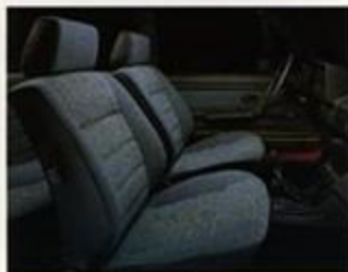
Comfortable, fully reclining bucket seats are standard on Cabriolet.

When the Cabriolet brought back open-air touring, it didn't forget old-fashioned performance. You'll thrill to the beat of a powerful 1.8 liter fuel-injected engine with 5-speed transmission. You'll conquer the road with an independent sport suspension, rack and pinion steering and front disc brakes.