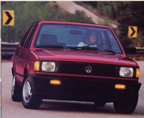
MSRP: Outsmart the high cost of driving.