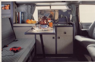
Both pages: EuroVan CV interior.