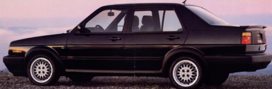
JETTA GL 16V

Always use proper tie-up technique.