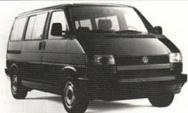
VOLKSWAGEN EUROVAN GL