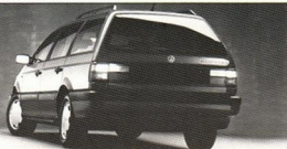
VOLKSWAGEN PASSAT CL