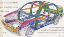
The Jetta III body is reinforced with welded steel cross-beams, plates, bars and tubes. It's a critical protective cage surrounded by front and rear ends with crush-absorbing "crumple" zones.

plates and tubes—including side impact bars. It's been reinforced significantly. Front and rear "crumple" zones, like those created by our exclusive mash seam welded front chassis members, guide crash energy in predetermined directions. ● Inside, there is an automatic front safety belt system with supplemental manual lap belts