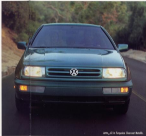
Jetta GL in Turquoise Overcast Metallic.