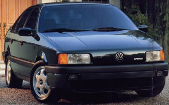
Passat GLX sedan in Black Beige Garnet Metallic.

This is the 1993 Volkswagen Passat. An accomplished 4-door sport sedan with true European road qualifications. And a perfect combination—notice we didn't say compromise—of comfort, safety, value and performance for drivers and passengers alike. ● There are five Passat models: the very well-equipped GL sedan and wagon, the luxurious GLS sedan and the performance-minded