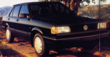
Fox Wolfsburg Edition 4-door in Onyx Black

The Volkswagen Fox proves a limited budget doesn't have to stand between you, quality German engineering and the reward of great driving fun. On the contrary, Fox presents a clever opportunity to get a lot of good things at a very affordable price. Things like the comfort, performance and excitement you might expect to find only in more expensive cars. Fox is avail-