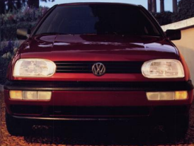
Golf III GL 4-door in Pearl Red Oceanmetal.

Golf III GL makes driving a marvelous experience. That's what our commitment is about. And we'll never change that.