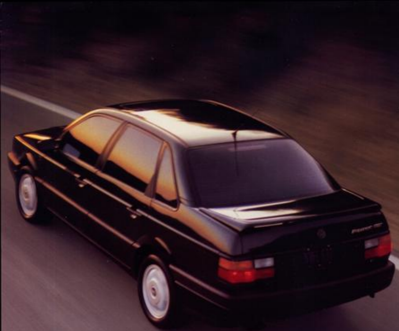
Passat 2.0T shown here in Classic Clean-Gloss metallic finish. Available special performance is perfectly suited to the temperament of America.