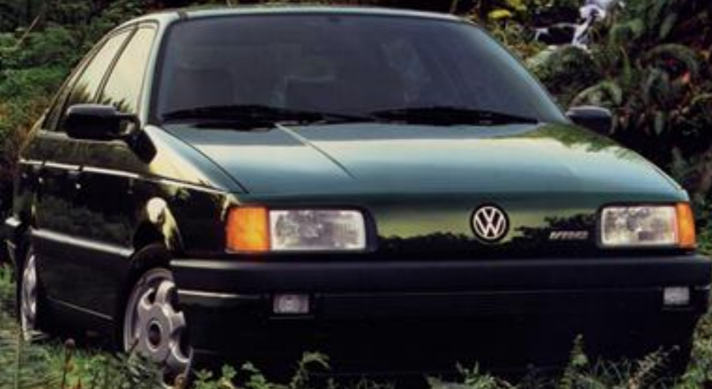
Do not drink. Whether you're taking pictures or manufacturing cars, Volkswagen always takes steps to protect the environment. A Clean Green Passat (20) is shown here in the Mt. Rainier in Washington's Olympic Peninsula, USA. The picture was created without harming the environment.