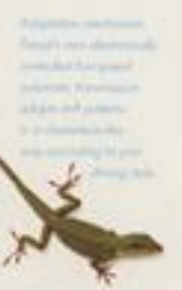
Passat's electronic traction control uses ABS sensors to determine the slip occurring in your driving. It gently brakes the slipping wheel, and transfers power to the wheel with the most grip.