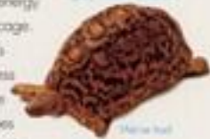
Served by the shell, front and rear crumple zones collapse on impact. Crush zones are constructed for a tightly-welded safety cage.