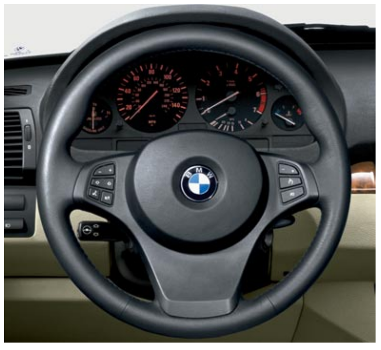
Three-spoke leather-wrapped sport steering wheel features power tilt/telescoping and controls for cruise, audio and (accessory) phone. (Included with Optional Sport Package)