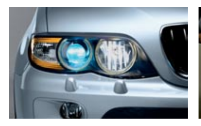
Xenon low- and high-beam headlights illuminate the road ahead and to the side with brilliant clarity. These headlights also feature auto-leveling. (std. in X5 4.4i; opt. in X5 3.0i)