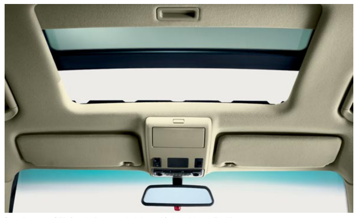
Power glass moonroof slides forward or tilts up at a touch to let in as much fresh air and sky as you like, while a wind deflector helps keep the wind out. Includes a sliding interior sunshade. (Optional equipment and included in Optional Premium Package for 3.0i and 4.4)