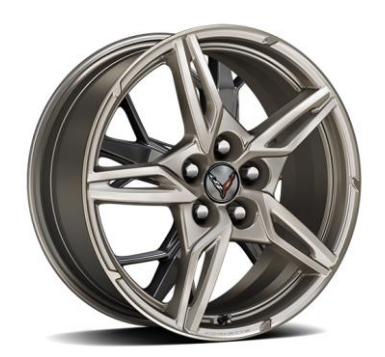
Performance Pewter-painted aluminum* 19" x 8.5" front and 20" x 10" rear 5-open-spoke

*Accessory LPO wheels are a second set of wheels. Please ensure customer desires 2 sets of wheels before ordering.