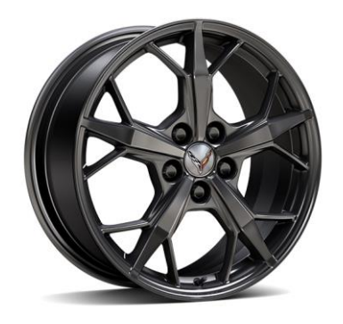
Black-painted aluminum* 19" x 8.5" front and 20" x 10" rear 5-trident-spoke