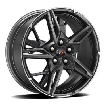
Carbon Flash-painted aluminum 19" x 8.5" front and 20" x 11" rear 5-open-spoke