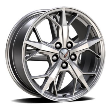
Sterling Silver-painted aluminum 19" x 8.5" front and 20" x 11" rear 5-trident-spoke machined-face