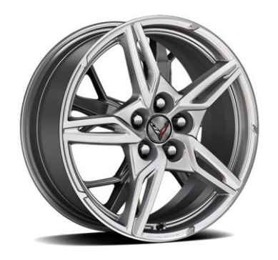
Bright Silver-painted aluminum (standard) 19" x 8.5" front and 20" x 11" rear 5-open-spoke