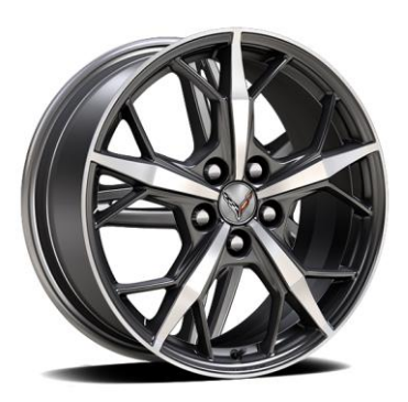
Spectra Gray-painted aluminum 19" x 8.5" front and 20" x 11" rear 5-trident-spoke machined-face