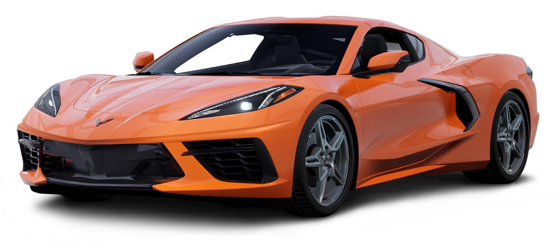
Sebring Orange Tintcoat Accelerate Yellow