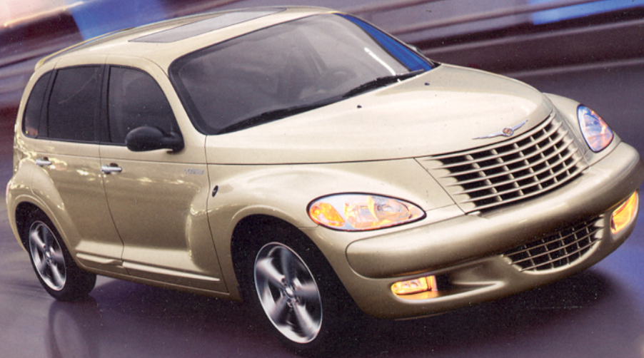
2005 PT Cruiser