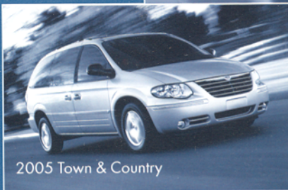
2005 Town & Country