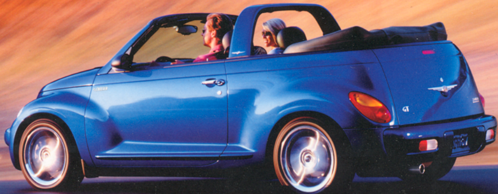
2005 PT Cruiser Convertible