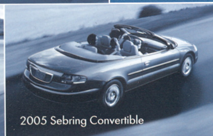
2005 Sebring Convertible

AT CHRYSLER, INSPIRATION IS NOT AN OPTION. IT COMES STANDARD IN EVERYTHING WE DO. AND IT LEADS TO VEHICLES THAT ARE EXCEPTIONAL IN WHAT THEY DO.