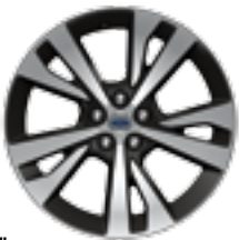
20" BRIGHT MACHINED-FACE ALUMINUM Standard