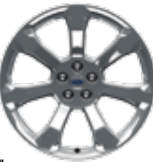
21" PREMIUM ALUMINUM Available