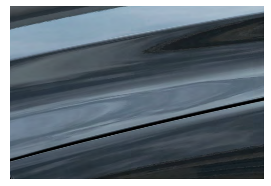
Visit our website to see all the vibrant color choices availab

Each element of our design process is intentional. Including the paint. Before a single drop of color is applied, master painters first perfect their technique by hand. Ensuring the surface of the Mazda3 has depth and saturation. Illuminating the curves and characteristics of our Kodo design. They apply color with the precision of highly sharpened senses. The machines used to paint the Mazda3 are calibrated to replicate the exact movement of this human technique. Our daring array of lustrous finishes may be the final touch on the Mazda3, but it is the first thing that will catch your eye.