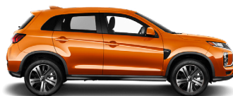
ES 2.0 Convenience Package 2WD or AWC