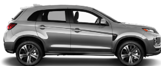
ES 2.0 2WD or AWC