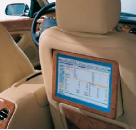
OFFICE COMPUTER SYSTEM TO REAR COMPARTMENT*