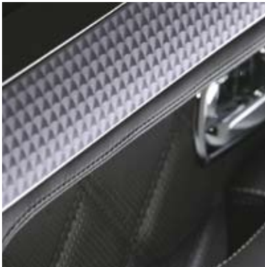
engine-turned aluminium inserts to waist rails