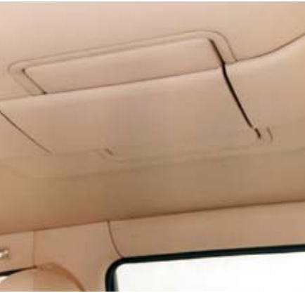
POWER-FOLD DVD & TV SCREEN STOWS IN ROOF PANEL*