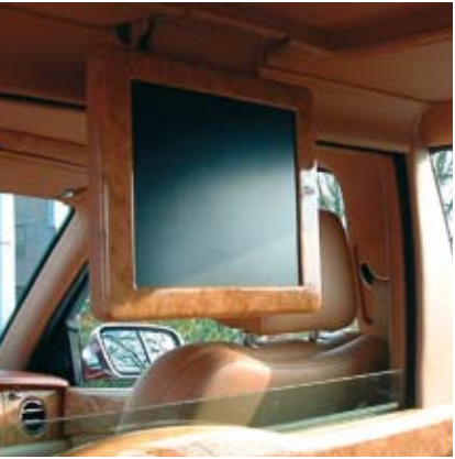
DVD & TV SYSTEM WITH POWER-FOLD LCD SCREEN*