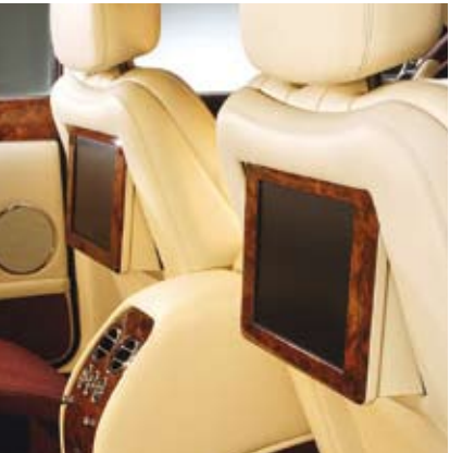
DVD & TV SYSTEM WITH TWIN LCD SCREENS TO SEAT BACKS*