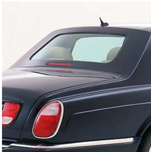
PRIVACY REAR WINDOW