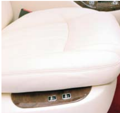
extended front seat cushion**