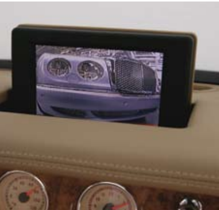
REVERSING CAMERA DISPLAY