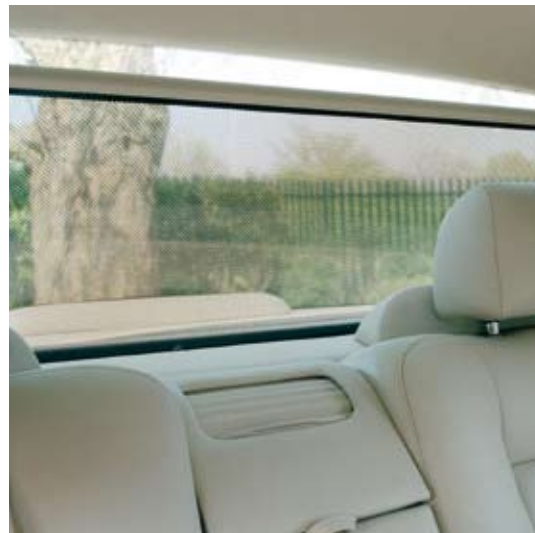
ELECTRIC BLIND TO REAR WINDOW