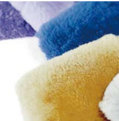
lambswool rugs matched to customer colour specification*