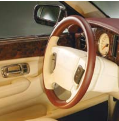
arnage with two-tone hide-trimmed multi-function steering wheel (interior shown is burgundy and magnolia hide with burr walnut veneer)