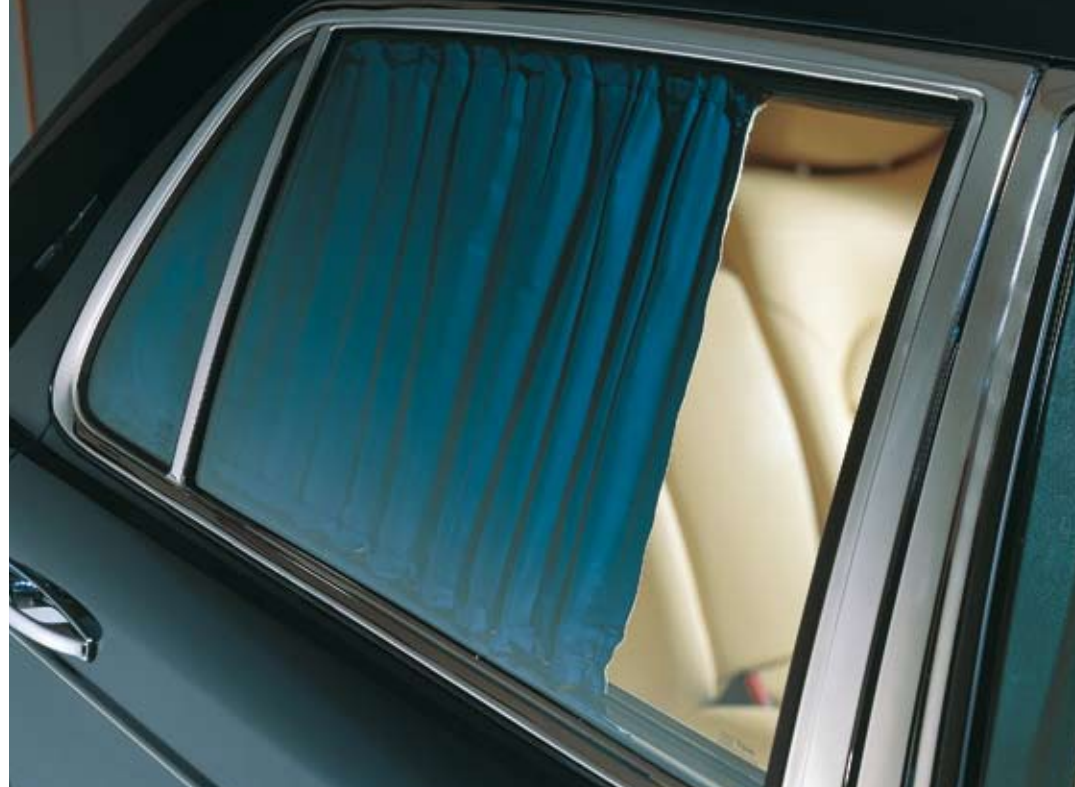
SILK CURTAINS TO REAR COMPARTMENT