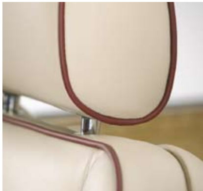
contrast piping to headrest and seat