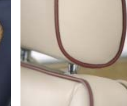
CONTRAST PIPING TO HEADREST AND SEAT