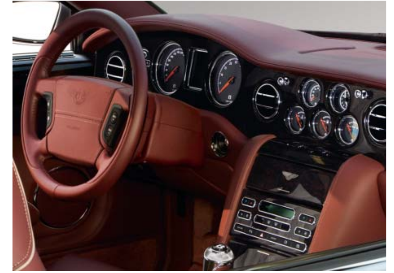
REDWOOD LEATHER HIDE WITH CINDER SANDWICH PIPING