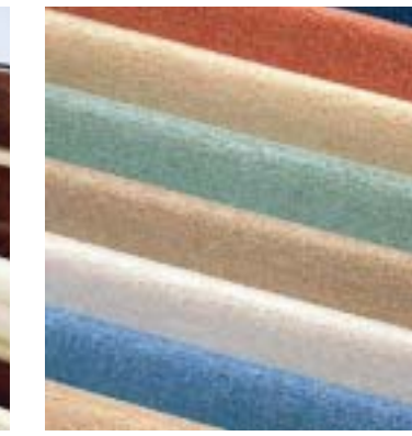
CARPETS MATCHED TO CUSTOMER COLOUR SPECIFICATION