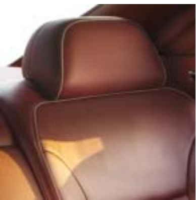
CONTRAST SANDWICH PIPING