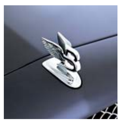
RETRACTABLE FLYING 'B' RADIATOR MASCOT (PAINTED RADIATOR SHELL)