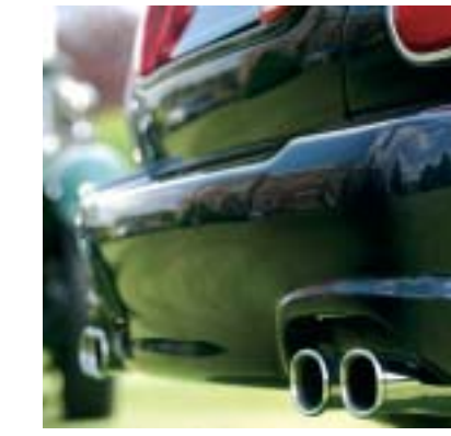
REAR SPORTS BUMPER AND QUAD EXHAUST TAIL PIPE FINISHERS