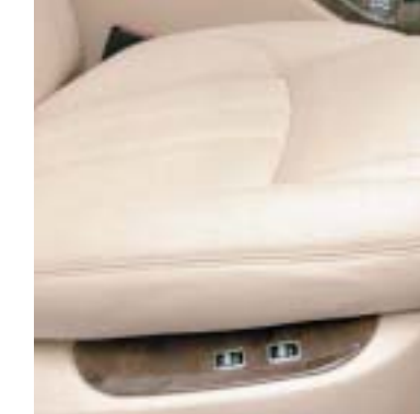
EXTENDED FRONT SEAT CUSHION