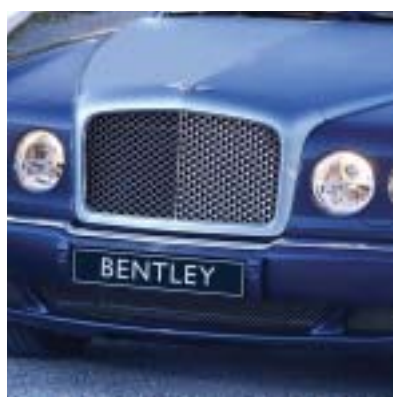
DUO TONE PAINT COMBINATION