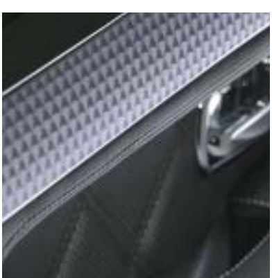
ENGINE-TURNED ALUMINIUM INSERTS TO WAIST RAILS