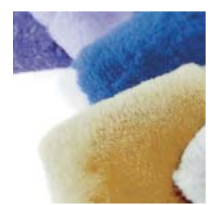
LAMBSWOOL RUGS MATCHED TO CUSTOMER COLOUR SPECIFICATION