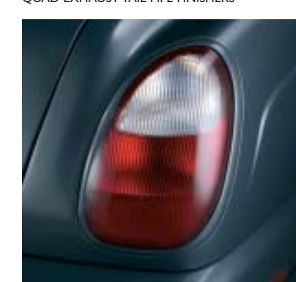
BODY COLOURED LAMP BEZELS