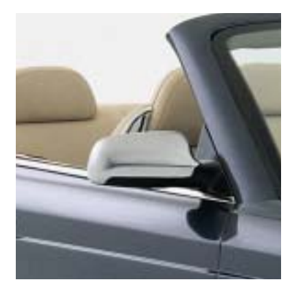
CHROME DOOR MIRROR CAPS