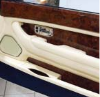
VENEERED DOOR PANELS

In true Mulliner fashion, the choice is yours. We can even colour match your upholstery hide, carpet, or lambswool rugs to your individual specification. It could be the colour of your favourite tie, or almost anything that catches your eye. You can tailor the interior as you see fit. You are in control.