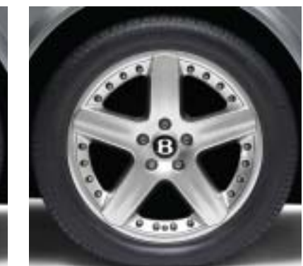
19" 5-SPOKE 2-PIECE 'STAR' ALUMINIUM ALLOY (POLISHED)