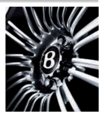
comprehensive paint palette – and intricate Fine Lines to make your Continental Flying Spur even more select.

And the same is true of colours. We have well over 100 stunning colours to choose from in our