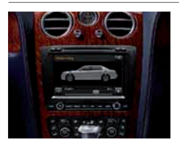
THE JOURNEY STARTS HERE.

To complement its modern interior, the Continental Flying Spur also boasts advanced touchscreen technology, from which both the driver and front-seat passenger can operate the state-of-the-art infotainment and satellite navigation system.