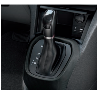
4-speed Automatic: The smooth-shifting automatic takes the stress out of busy city driving.

Choose between a 67PS 1.0 litre 3-cylinder petrol engine, or an 87PS 1.2 litre 4-cylinder unit. The engines are designed to deliver a precise 5-speed manual transmission, or a smooth-shifting 4-speed automatic experience on the 1.2 litre. The gearshift is located conveniently high up for easy operation, so you can shift through the gears and glide from street to street.