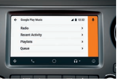
Apple CarPlay™ and Android Auto™: The 7" touchscreen provides you with the safest way to access the potential of your compatible iPhone or compatible Android smartphone on the move. Standard on Premium SE models.

To help you on your way, there's a new navigation system with LIVE Services, while Apple CarPlay™ and Android Auto™ connects with compatible iPhones and Android smartphones. It's ideal for avoiding traffic – helping you to stay informed, in touch and entertained along the way.