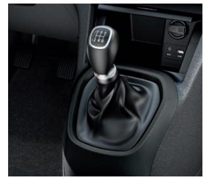
5-speed Manual: Precise manual gearshifts bring extra driving pleasure, especially on country roads.

Refined engines and transmissions provide all the performance you need, combined with low fuel consumption and low emissions for the best of both worlds.