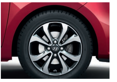
Wheels: The sporty 15" alloy wheel contributes to the bold new attitude of the i10*.

From back to front, the i10 showcases our fluidic design philosophy. There's a totally new sculpted front bumper that's also home to the new cascading grille and prominent LED daytime running lights. New wheels, a contrasting rear bumper insert and redesigned rear combination lamps complete the picture*.