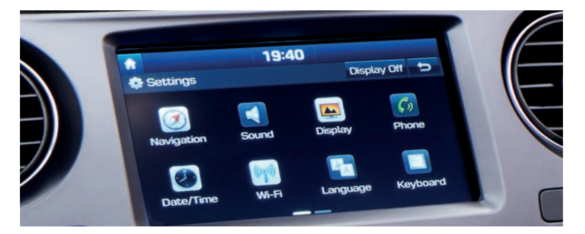
Navigation with LIVE Services': Route guidance is augmented by live traffic information, speed camera alerts", weather conditions and point of interest data. Standard on Premium SE models.

Advanced connectivity is just one of the qualities that position the i10 at amongst the best in its class.