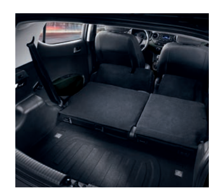
Boot Space: Together with class-leading cabin space, i10 boasts one of the largest boots in its class, with a capacity of up to 252 litres.

It's amazing how much space you'll find in the i10. Its boot is one of the largest in the class and there's plenty of room for your friends in the back.