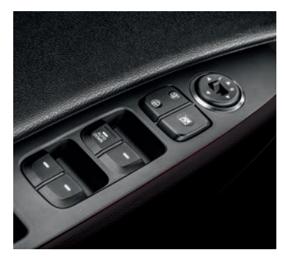
Rear Power Windows: Unusual in this class, the windows in the rear doors can be raised and lowered at the touch of a button. Available from SE models.

Inside the i10, there's room for five to sit in comfort, so you and your passengers can enjoy each trip. With a heated steering wheel, automatic air conditioning, heated front seats and many practical storage possibilities, the i10 is one of the best-equipped cars in its class<sup>†</sup>.