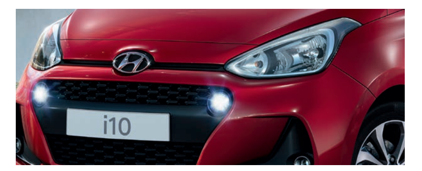
Cascading grille: The expressive shape of the new cascading grille emphasises the confident character of the i10.

The established design of the i10 has been given a sporty new attitude that really catches the eye.