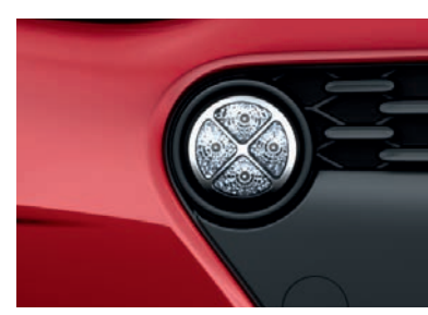
LED daytime running lights: The new round LED daytime running lights add an extra touch of sportiness to the front of the i10*.