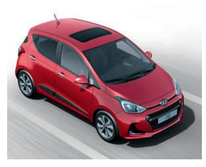
Lane Departure Warning (LDW) System: Warns you audibly and visibly of unintended departure from the traffic lane, when detected by the multi-function camera.